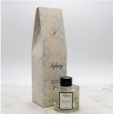
(S084) SCENT - ROCKSALT & DRIFTWOOD