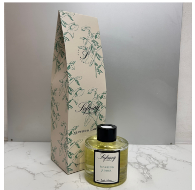
(SO95) SCENT - SEAWEED & JUNIPER