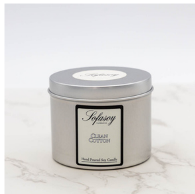
(S059) SCENT - CLEAN COTTON