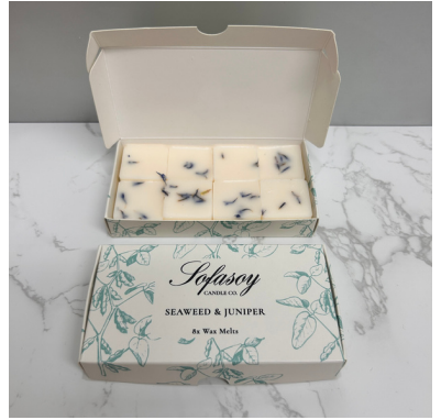
(SO132) SCENT - SEAWEED & JUNIPER