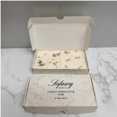
(SO130) SCENT - CUBAN TOBACCO & OAK