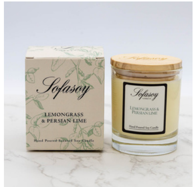
(SO17) SCENT - LEMONGRASS & PERSIAN LIME