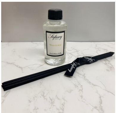
(SO111) SCENT - WILD GORSE