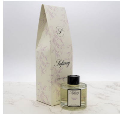
(SO91) SCENT - VIOLET & ROSE