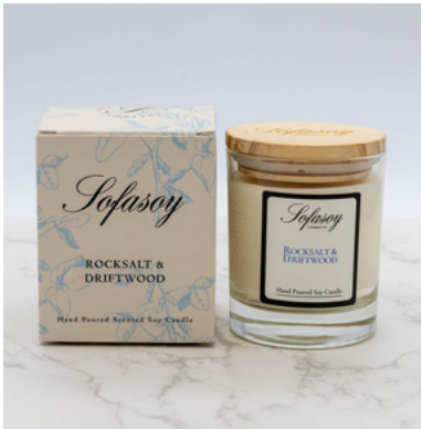
(SO18) SCENT - ROCKSALT & DRIFTWOOD