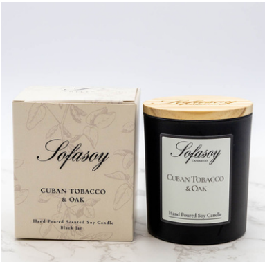
(S006) SCENT - CUBAN TOBACCO & OAK