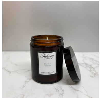
(SO44) SCENT - PEAR & FREESIA