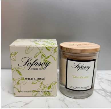
(SO28) SCENT - WILD GORSE