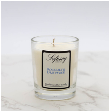
(S067) SCENT - ROCKSALT & DRIFTWOOD