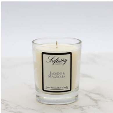
(S073) SCENT - JASMINE & MAGNOLIA