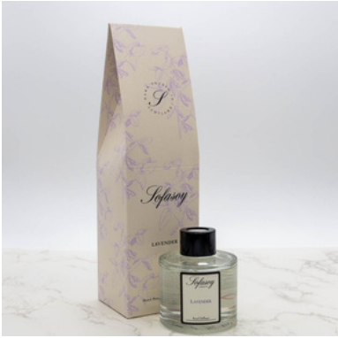
(S082) SCENT - LAVENDER