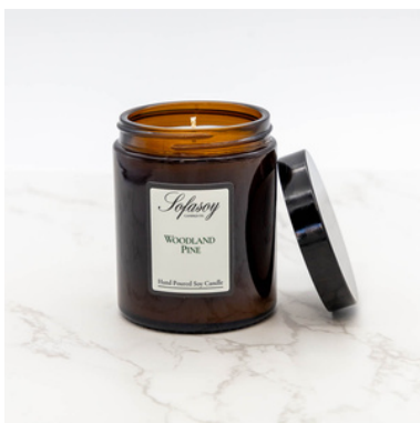
(SO41) SCENT - WOODLAND PINE