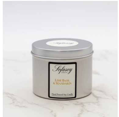
(S055) SCENT - LIME, BASIL & MANDARIN