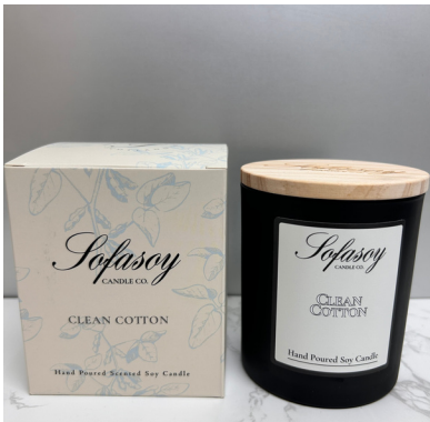
(SO15) SCENT - CLEAN COTTON