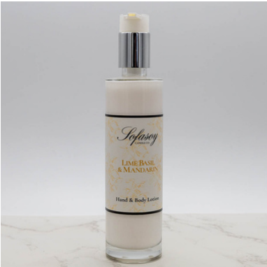
(SO117) SCENT - LIME, BASIL & MANDARIN HAND & BODY LOTION