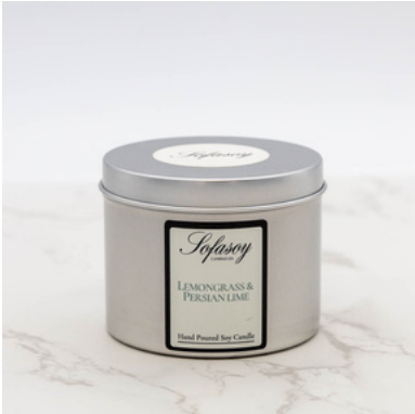
(S049) SCENT - LEMONGRASS & PERSIAN LIME