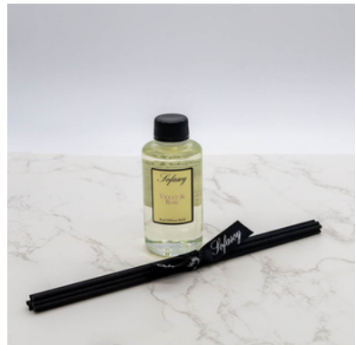
(SO106) SCENT - VIOLET & ROSE