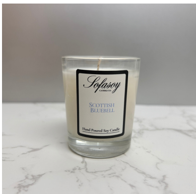
(S081) SCENT - SCOTTISH BLUEBELL