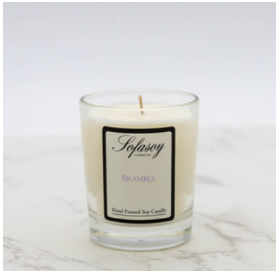
(S077) SCENT - BRAMBLE