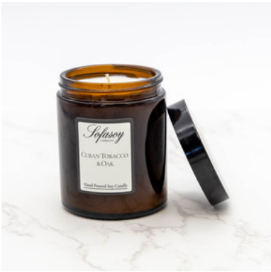
(S036) SCENT - CUBAN TOBACCO & OAK