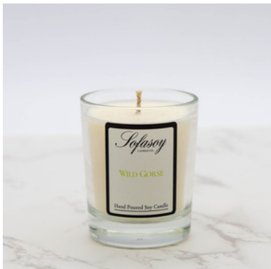
(S079) SCENT - WILD GORSE