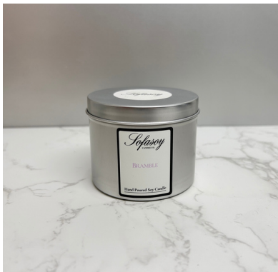
(SO62) SCENT - BRAMBLE