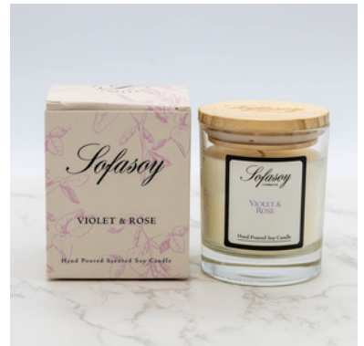
(SO25) SCENT - VIOLET & ROSE