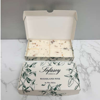
(SO128) SCENT - WOODLAND PINE