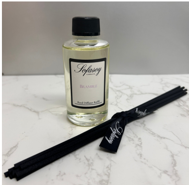
(SO107) SCENT - BRAMBLE