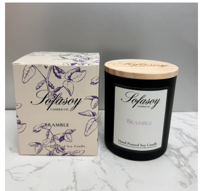
(SO12) SCENT - BRAMBLE