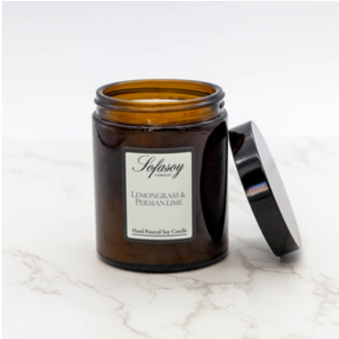
(S032) SCENT - LEMONGRASS & PERSIAN LIME