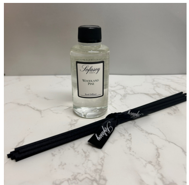
(SO110) SCENT - WOODLAND PINE