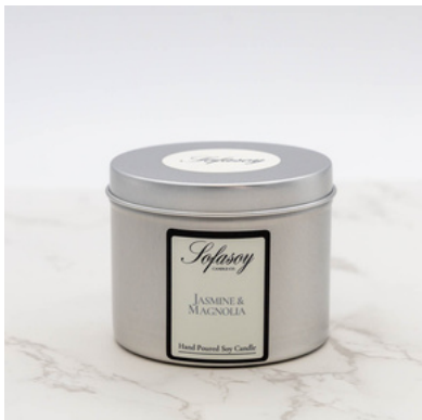
(S056) SCENT - JASMINE & MAGNOLIA