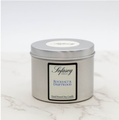
(S050) SCENT - ROCKSALT & DRIFTWOOD