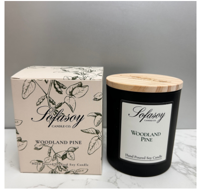
(SO14) SCENT - WOODLAND PINE