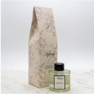
(SO88) SCENT - RHUBARB & ELDERFLOWER