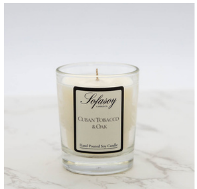
(S070) SCENT - CUBAN TOBACCO & OAK