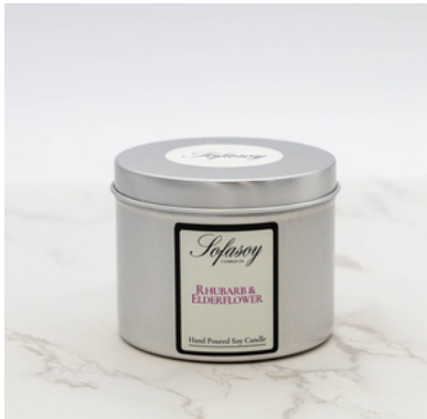
(S054) SCENT - RHUBARB & ELDERFLOWER