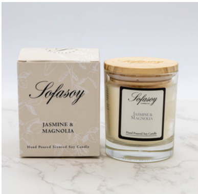
(SO24) SCENT - JASMINE & MAGNOLIA