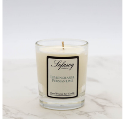
(S066) SCENT - LEMONGRASS & PERSIAN LIME