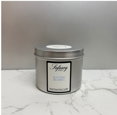
(SO60) SCENT - SCOTTISH BLUEBELL