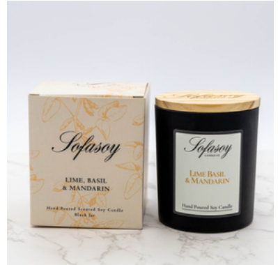
(SO08) SCENT - LIME, BASIL & MANDARIN