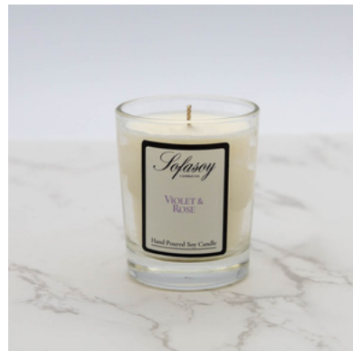
(S074) SCENT - VIOLET & ROSE