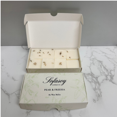
(SO124) SCENT - PEAR & FREESIA