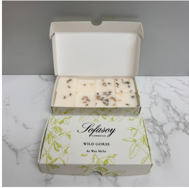
(SO119) SCENT - WILD GORSE