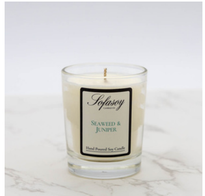
(S078) SCENT - SEAWED & JUNIPER