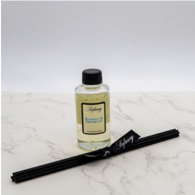
(S099) SCENT - ROCKSALT & DRIFTWOOD