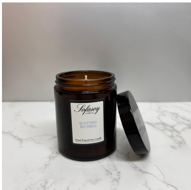
(SO45) SCENT - SCOTTISH BLUEBELL