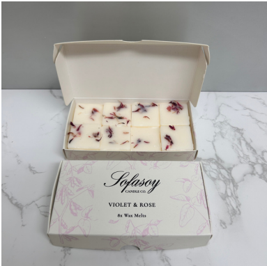
(SO123) SCENT - VIOLET & ROSE