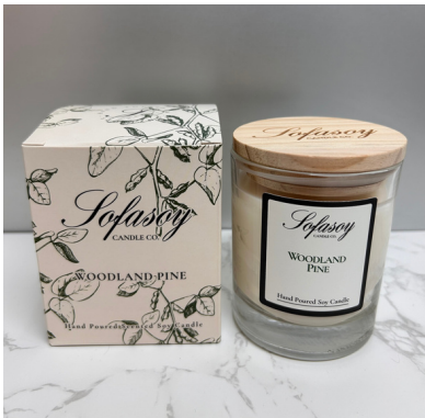
(SO30) SCENT - WOODLAND PINE