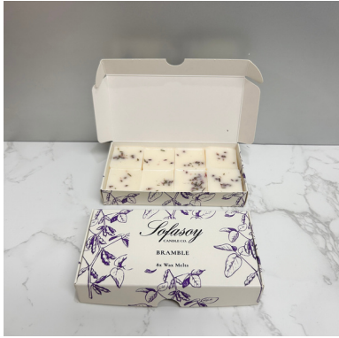
(SO126) SCENT - BRAMBLE