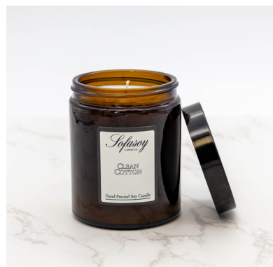
(SO42) SCENT - CLEAN COTTON