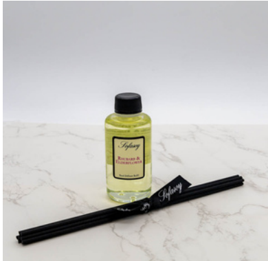
(SO103) SCENT - RHUBARB & ELDERFLOWER