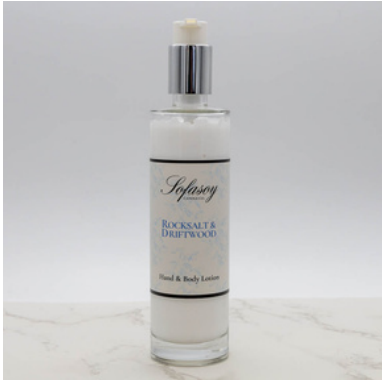
(SO113) SCENT - ROCKSALT & DRIFTWOOD HAND & BODY LOTION