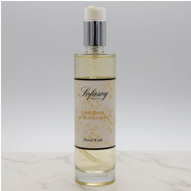
(SO116) SCENT - LIME, BASIL & MANDARIN HAND WASH