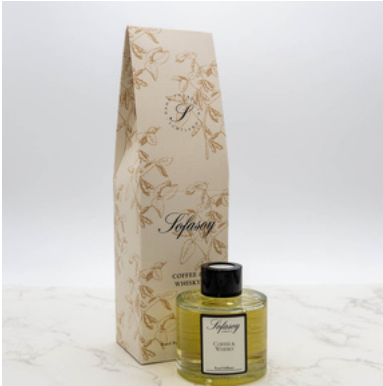
(S085) SCENT - COFFEE & WHISKY