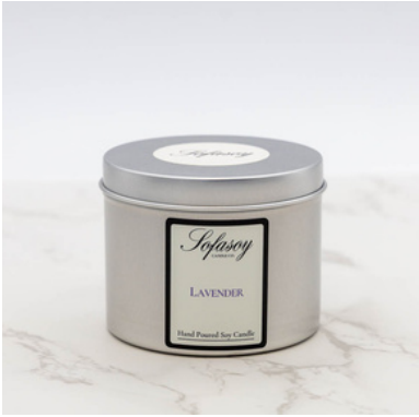
(S048) SCENT - LAVENDER