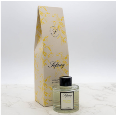
(S086) SCENT - PINEAPPLE & COCONUT