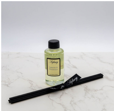
(SO105) SCENT - JASMINE & MAGNOLIA