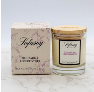
(SO22) SCENT - RHUBARB & ELDERFLOWER