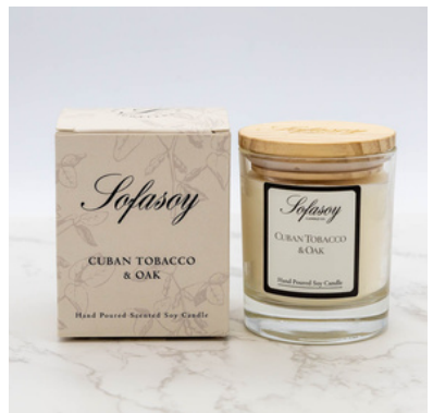
(SO21) SCENT - CUBAN TOBACCO & OAK