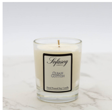
(S076) SCENT - CLEAN COTTON