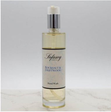
(SO112) SCENT - ROCKSALT & DRIFTWOOD HAND WASH