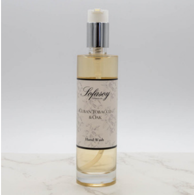
(SO114) SCENT - CUBAN TOBACCO & OAK HAND WASH