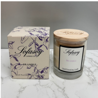
(SO26) SCENT - BRAMBLE