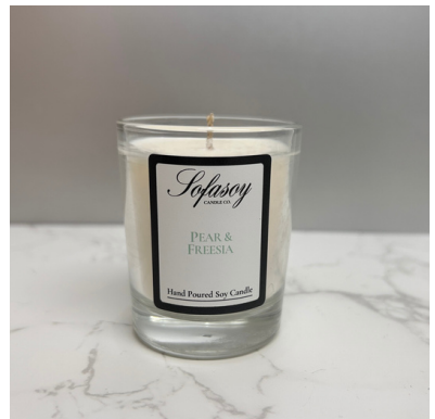
(S080) SCENT - PEAR & FREESIA