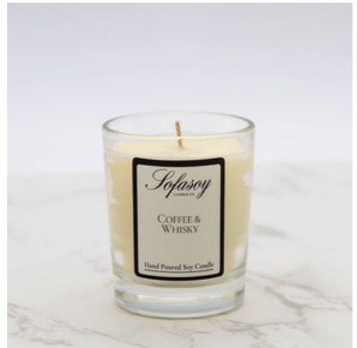
(S068) SCENT - COFFEE & WHISKY