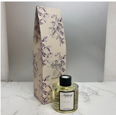
(SO96) SCENT - BRAMBLE