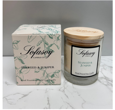
(SO29) SCENT - SEAWEED & JUNIPER