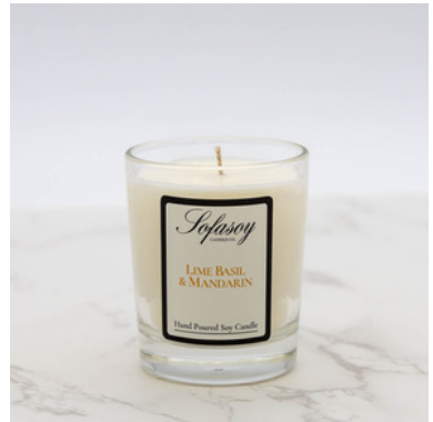
(S072) SCENT - LIME, BASIL & MANDARIN