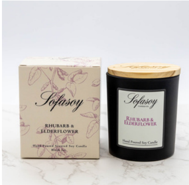
(SO07) SCENT - RHUBARB & ELDERFLOWER