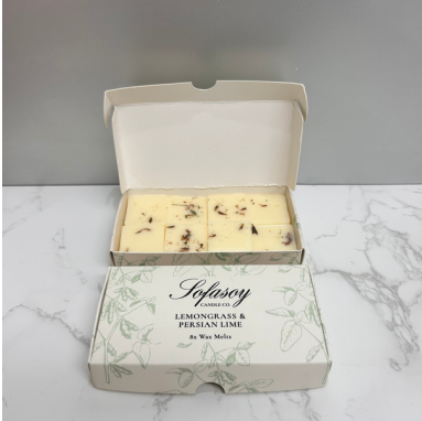
(SO127) SCENT - LEMONGRASS & PERSIAN LIME