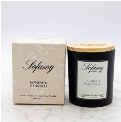
(SO09) SCENT - JASMINE & MAGNOLIA