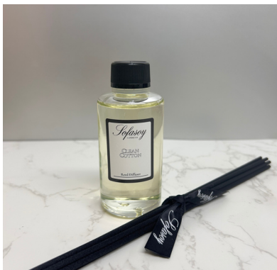
(SO109) SCENT - CLEAN COTTON