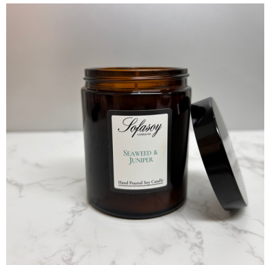
(SO46) SCENT - SEAWEED & JUNIPER