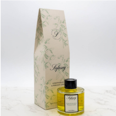
(S083) SCENT - LEMONGRASS & PERSIAN LIME