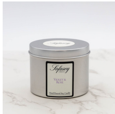
(S057) SCENT - VIOLET & ROSE