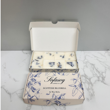
(SO121) SCENT - SCOTTISH BLUEBELL