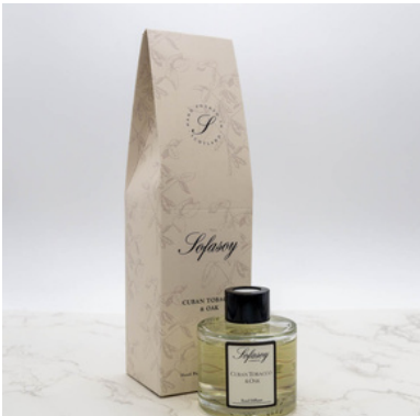
(S087) SCENT - CUBAN TOBACCO & OAK