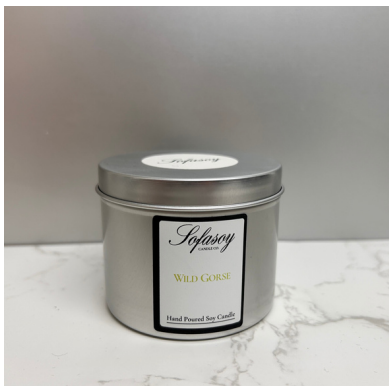
(SO64) SCENT - WILD GORSE