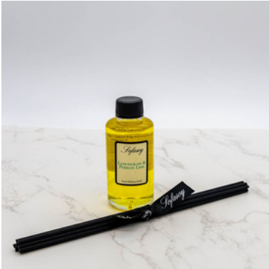
(S098) SCENT - LEMONGRASS & PERSIAN LIME