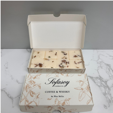
(SO129) SCENT - COFFEE & WHISKY