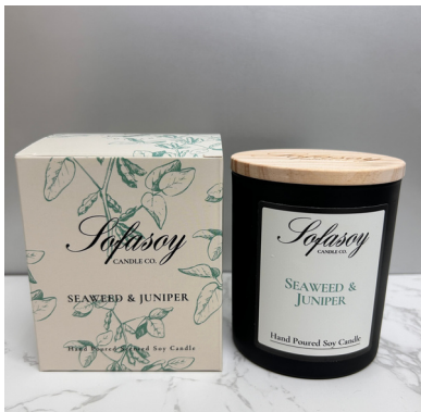
(SO11) SCENT - SEAWEED & JUNIPER