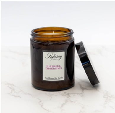
(SO37) SCENT - RHUBARB & ELDERFLOWER