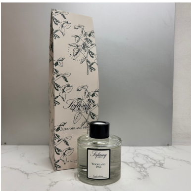
(SO94) SCENT - WOODLAND PINE