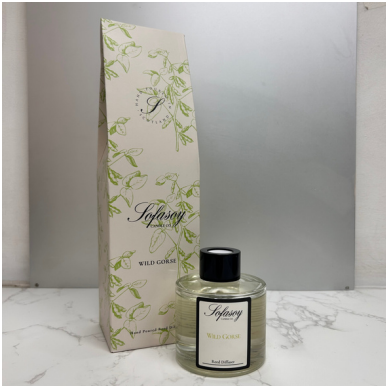
(SO92) SCENT - WILD GORSE