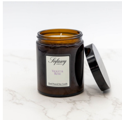
(SO40) SCENT - VIOLET & ROSE