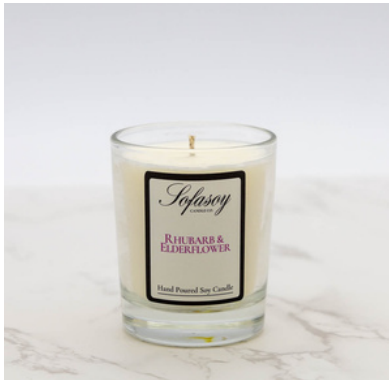
(S071) SCENT - RHUBARB & ELDERFLOWER