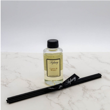
(S0100) SCENT - COFFEE & WHISKY