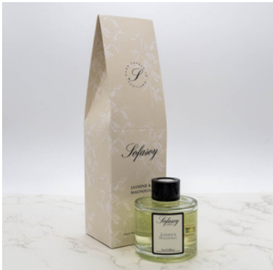
(SO90) SCENT - JASMINE & MAGNOLIA