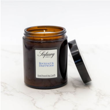
(S033) SCENT - ROCKSALT & DRIFTWOOD