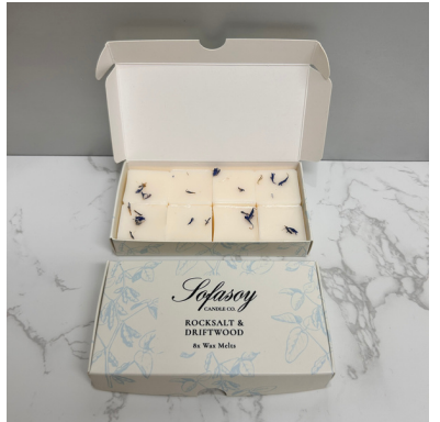
(SO134) SCENT - ROCKSALT & DRIFTWOOD