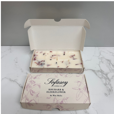
(SO135) SCENT - RHUBARB & ELDERFLOWER