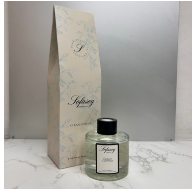
(SO93) SCENT - CLEAN COTTON