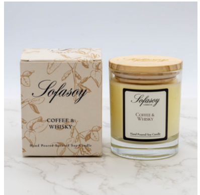
(SO19) SCENT - COFFEE & WHISKY