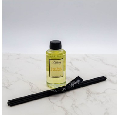
(SO104) SCENT - LIME, BASIL & MANDARIN