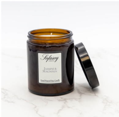
(SO39) SCENT - JASMINE & MAGNOLIA