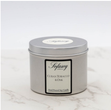
(S053) SCENT - CUBAN TOBACCO & OAK