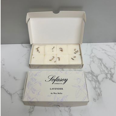
(SO120) SCENT - LAVENDER