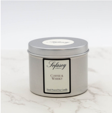
(S051) SCENT - COFFEE & WHISKY