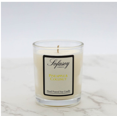
(S069) SCENT - PINEAPPLE & COCONUT