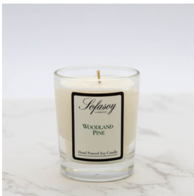
(S075) SCENT - WOODLAND PINE