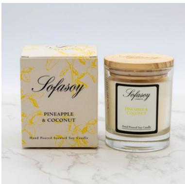
(SO20) SCENT - PINEAPPLE & COCONUT