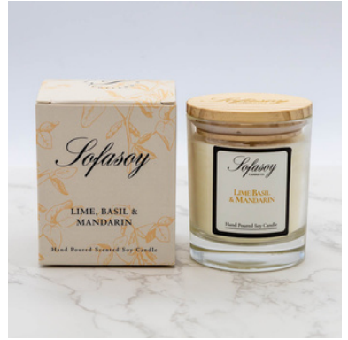
(SO23) SCENT - LIME, BASIL & MANDARIN