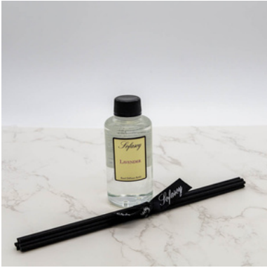
(S097) SCENT - LAVENDER