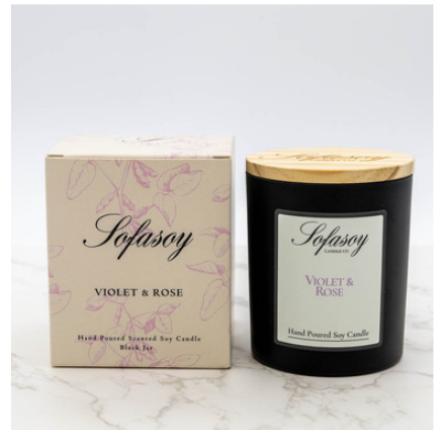
(SO10) SCENT - VIOLET & ROSE