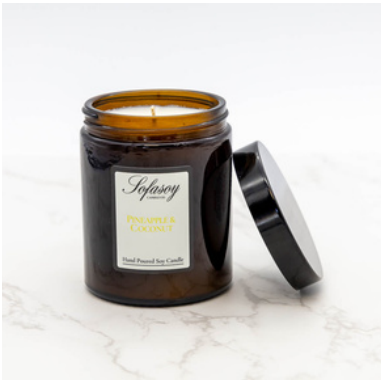
(S035) SCENT - PINEAPPLE & COCONUT