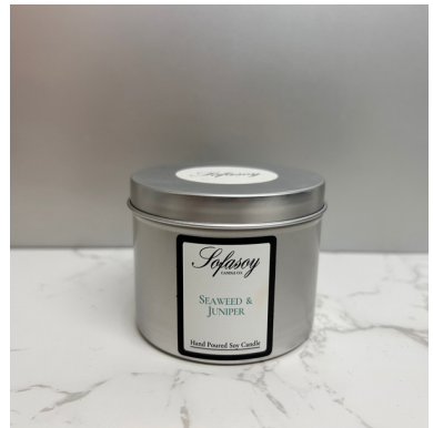
(SO63) SCENT - SEAWEED & JUNIPER