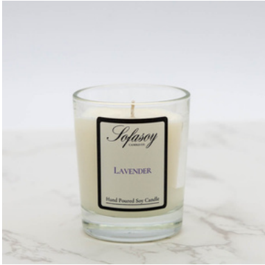
(S065) SCENT - LAVENDER