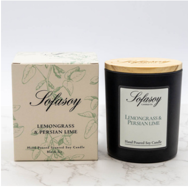
(S002) SCENT - LEMONGRASS & PERSIAN LIME