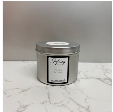
(SO61) SCENT - PEAR & FREESIA