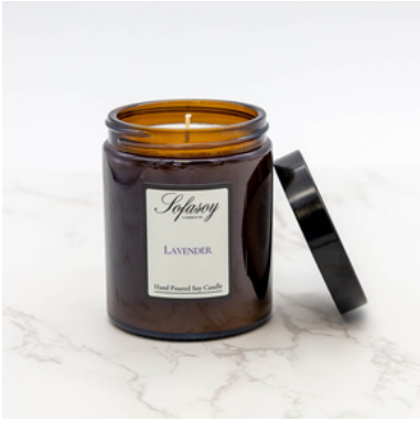
(S031) SCENT - LAVENDER