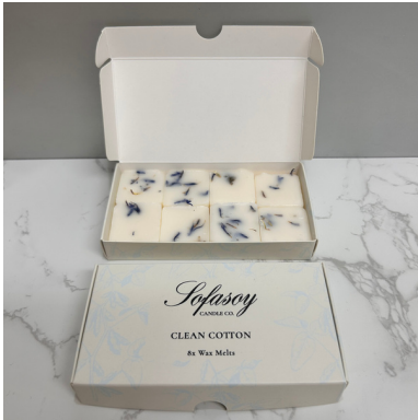
(SO133) SCENT - CLEAN COTTON