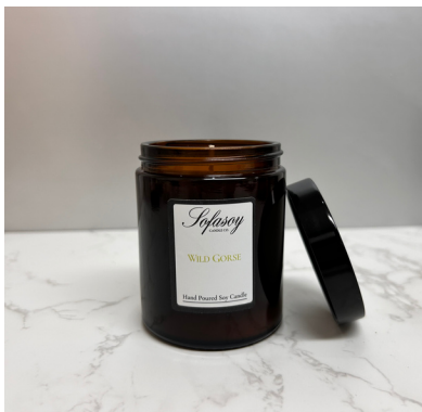
(SO47) SCENT - WILD GORSE