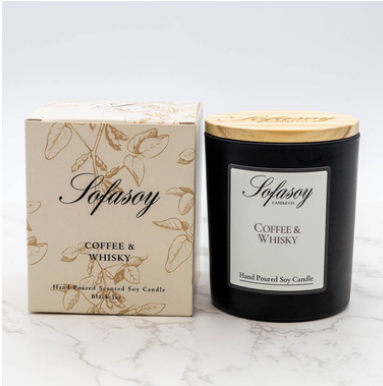
(S004) SCENT - COFFEE & WHISKY