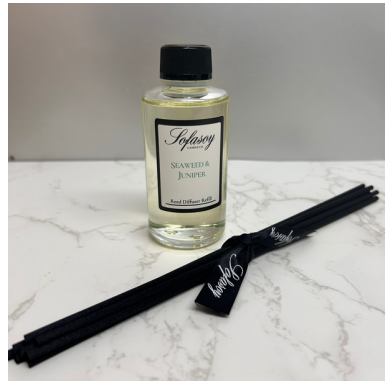
(SO108) SCENT - SEAWEED & JUNIPER