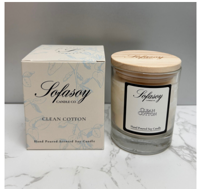
(SO27) SCENT - CLEAN COTTON