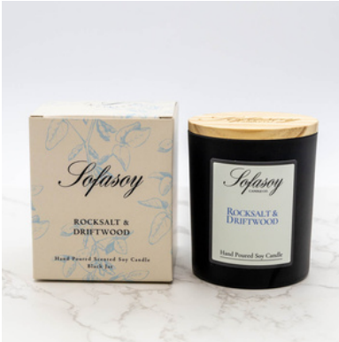
(S003) SCENT - ROCKSALT & DRIFTWOOD