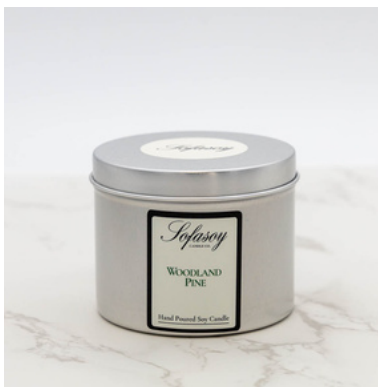
(S058) SCENT - WOODLAND PINE