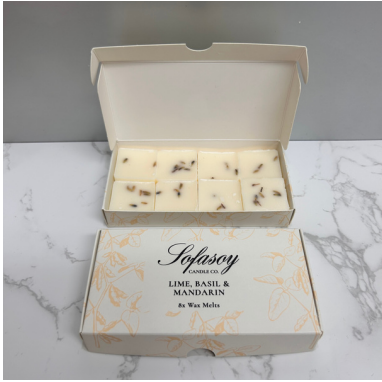
(SO131) SCENT - LIME, BASIL & MANDARIN