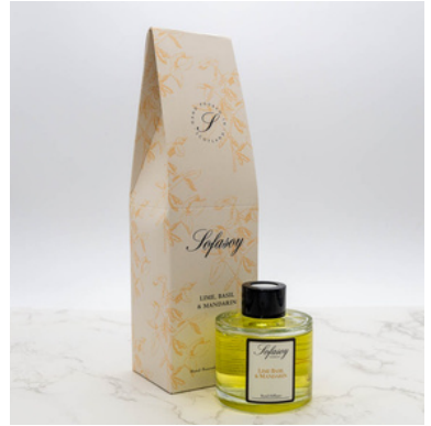
(SO89) SCENT - LIME, BASIL & MANDARIN