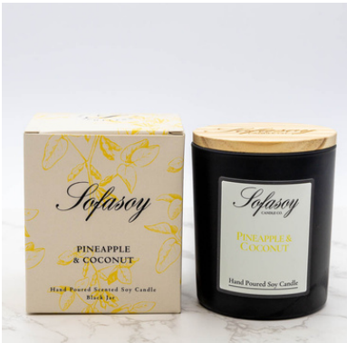
(S005) SCENT - PINEAPPLE & COCONUT