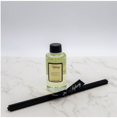
(S0101) SCENT - PINEAPPLE & COCONUT