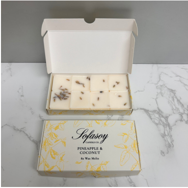
(SO118) SCENT - PINEAPPLE & COCONUT