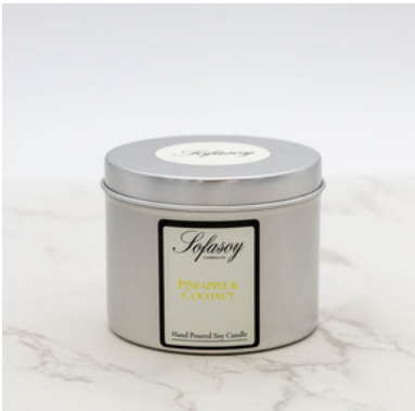
(S052) SCENT - PINEAPPLE & COCONUT