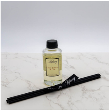
(S0102) SCENT - CUBAN TOBACCO & OAK