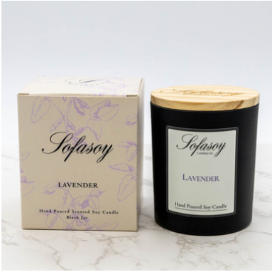
(S001) SCENT - LAVENDER