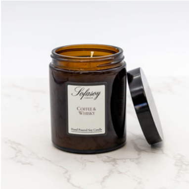
(S034) SCENT - COFFEE & WHISKY