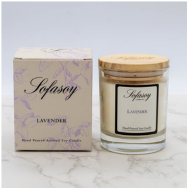
(SO16) SCENT - LAVENDER