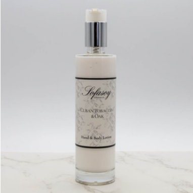
(SO115) SCENT - CUBAN TOBACCO & OAK HAND & BODY LOTION