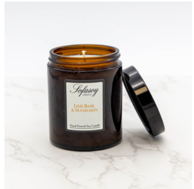
(SO38) SCENT - LIME, BASIL & MANDARIN