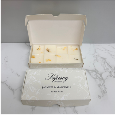
(SO125) SCENT - JASMINE & MAGNOLIA