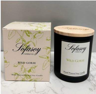
(SO13) SCENT - WILD GORSE