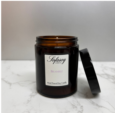
(SO43) SCENT - BRAMBLE