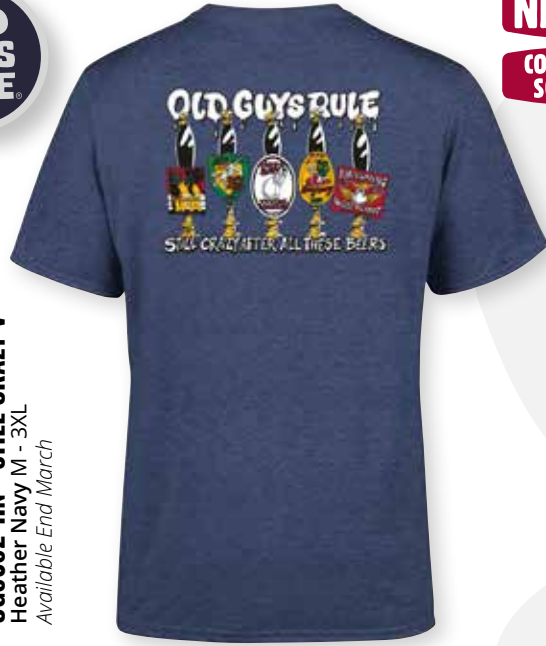
OG6062-HN - STILL CRAZY V Heather Navy M - 3XL Available End March