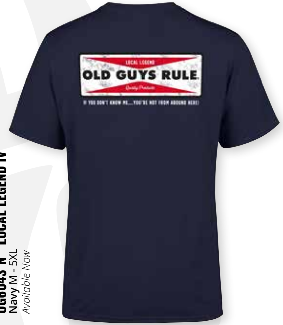
OG6043-N - LOCAL LEGEND IV Navy M - 5XL Available Now