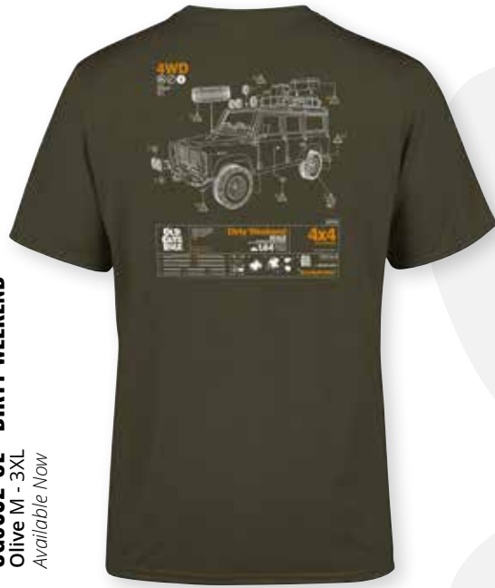
OG6002-01 - DIRTY WEEKEND Olive M - 3XL Available Now