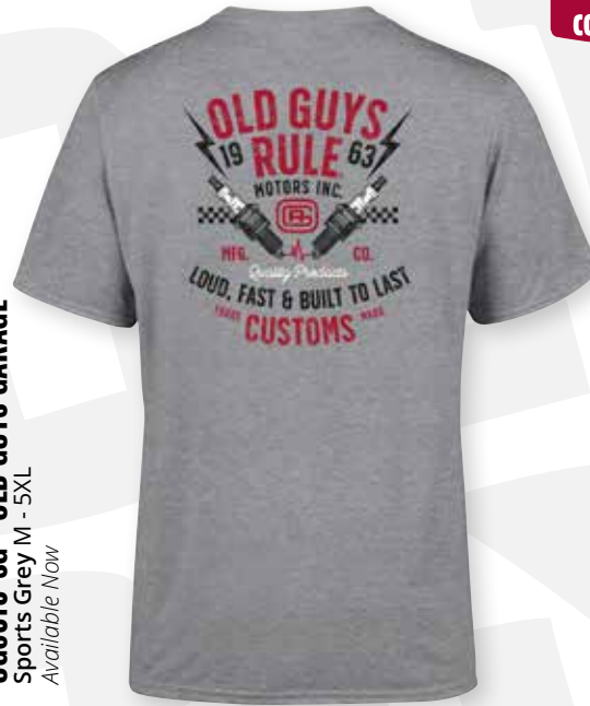
OG6010-SG - OLD GUYS GARAGE Sports Grey M - 5XL Available Now