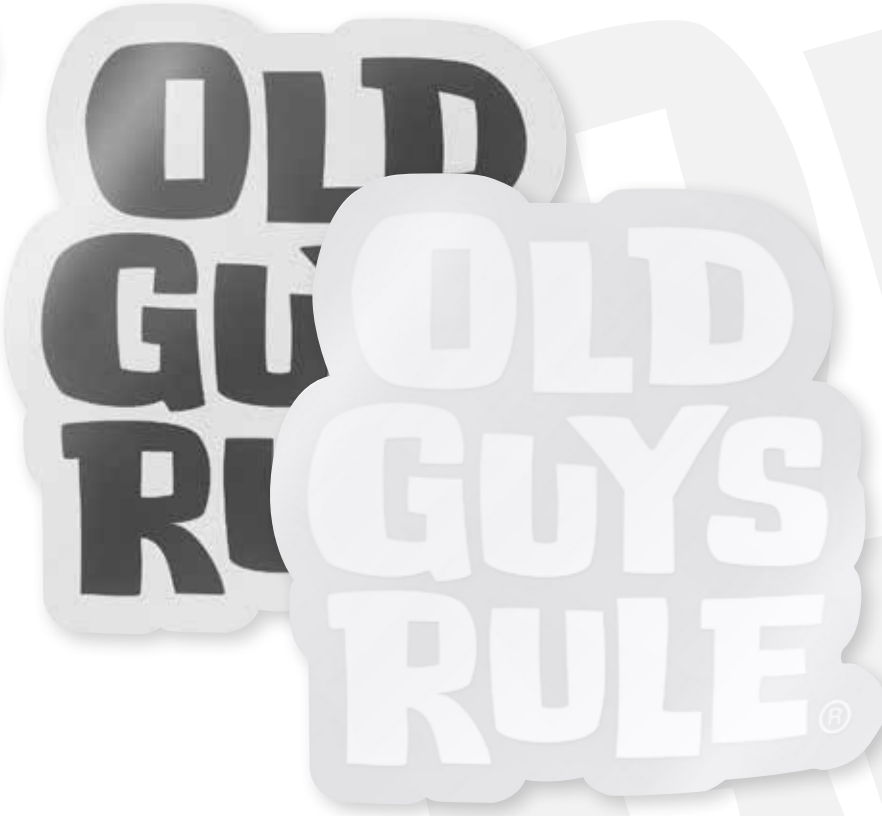
DEC002 - STACKED LOGO (WHITE) Approx 10cm x 10cm 1 Colour on Clear