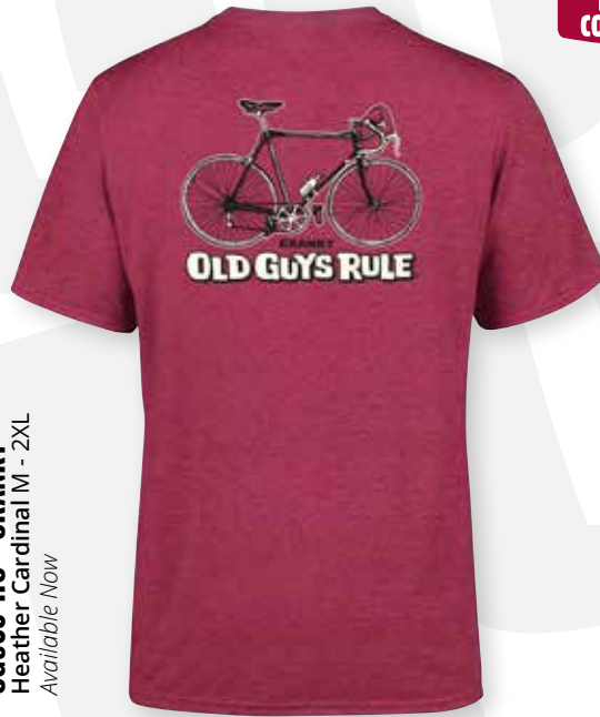
OG503-HC - CRANKY Heather Cardinal M - 2XL Available Now