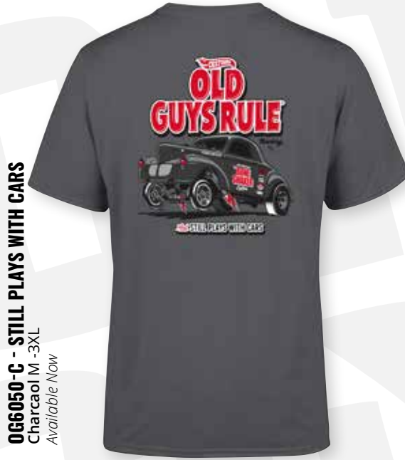
OG6050-C - STILL PLAYS WITH CARS Charcoal M - 3XL Available Now