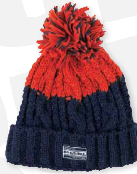
BNE027 - APRÉS BEANIE Navy/Red OSFM Available Now