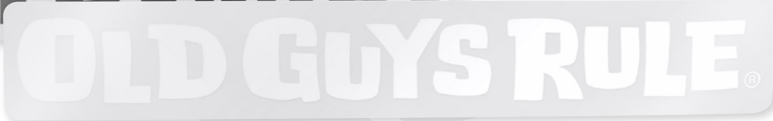
DEC004 - HORIZONTAL LOGO (WHITE) Approx 27cm x 4cm 1 Colour on Clear