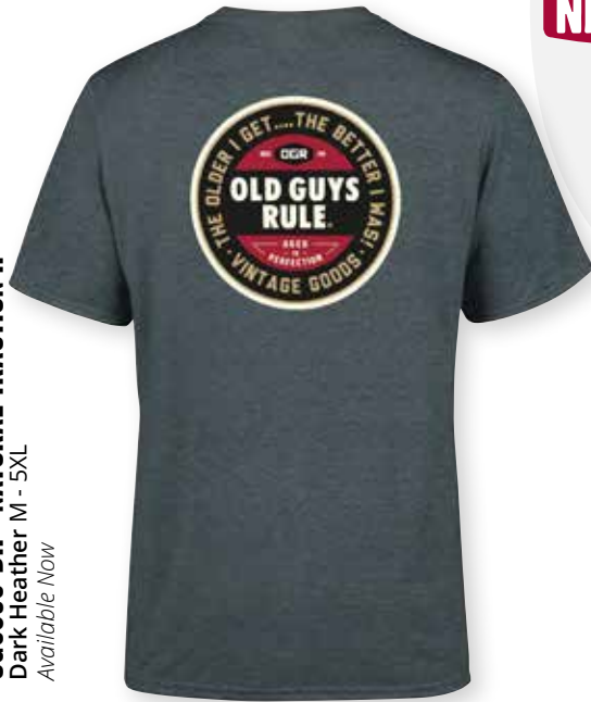
OG6056-DH - NATURAL TRACTION II Dark Heather M - 5XL Available Now