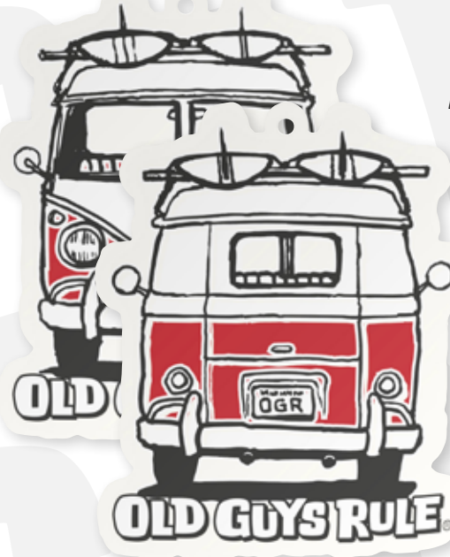
AIR002-CR - GOOD VIBES New Car Air Freshener Available Now