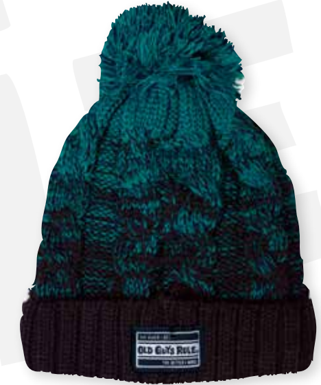
BNE005 - OMBRÉ BEANIE