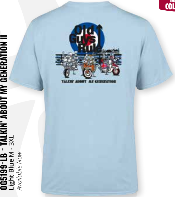
OG5199-LB - TALKIN' ABOUT MY GENERATION II Light Blue M - 3XL Available Now