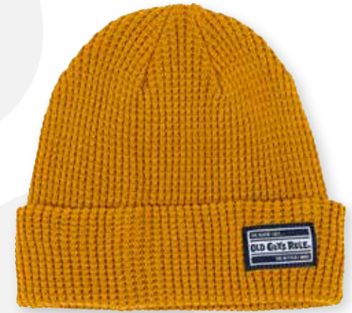
BNE013 - ORGANIC WAFFLE BEANIE Mustard OSFM Available Now