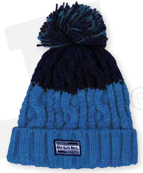
BNE028 - APRÉS BEANIE Navy/Azure Blue OSFM Available Now