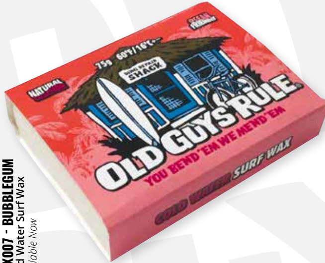
WAX007 - BUBBLEGUM Cold Water Surf Wax Available Now