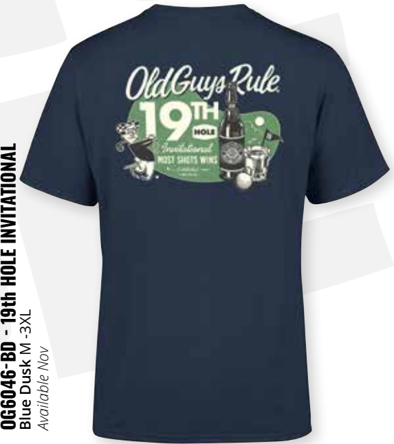
OG6046-BD - 19th HOLE INVITATIONAL Blue Dusk M - 3XL Available Now