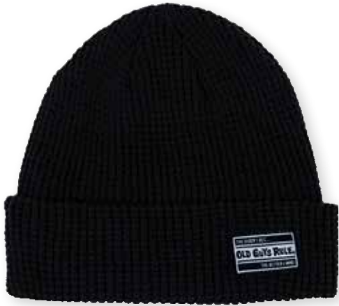
BNE026 - ORGANIC WAFFLE BEANIE Black OSFM Available Now