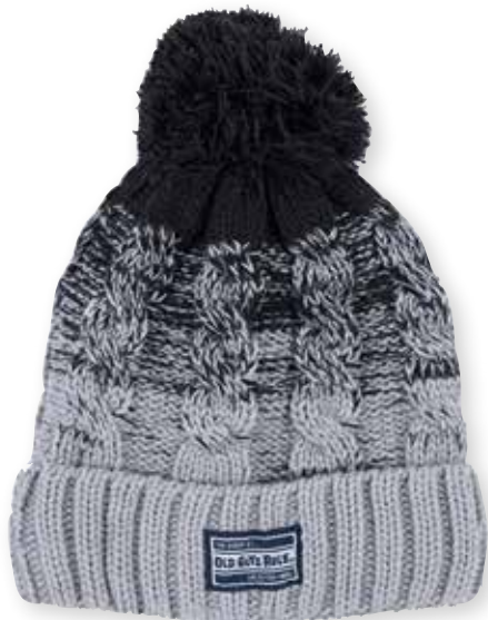
BNE009 - OMBRÉ BEANIE Black/Grey OSFM Available Now