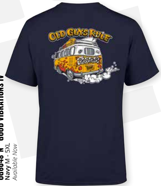
OG6048-N - GOOD VIBRATIONS IV Navy M - 5XL Available Now