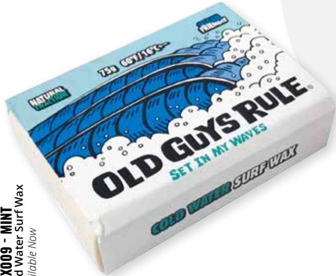
WAX009 - MINT Cold Water Surf Wax Available Now