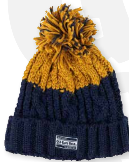
BNE019 - APRÉS BEANIE Navy/Mustard OSFM Available Now