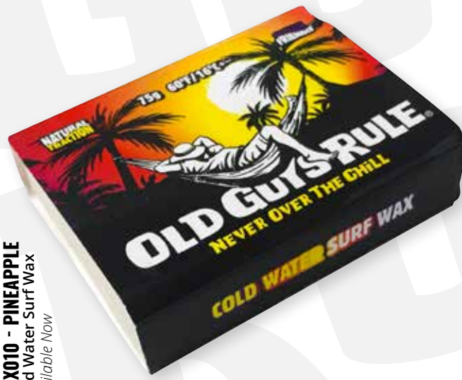
WAX010 - PINEAPPLE Cold Water Surf Wax Available Now