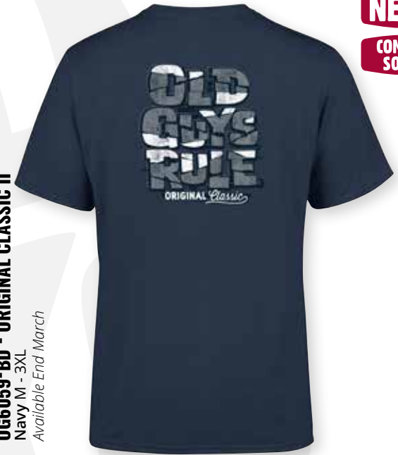
OG6059-BD - ORIGINAL CLASSIC II Navy M - 3XL Available End March