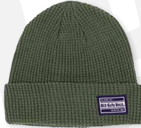
BNE011 - ORGANIC WAFFLE BEANIE Olive OSFM Available Now