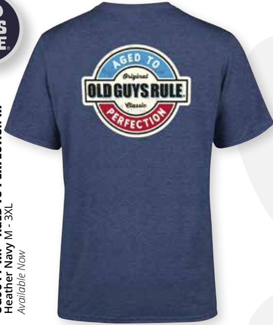
OG6044-HN - AGED TO PERFECTION III Heather Navy M - 3XL Available Now