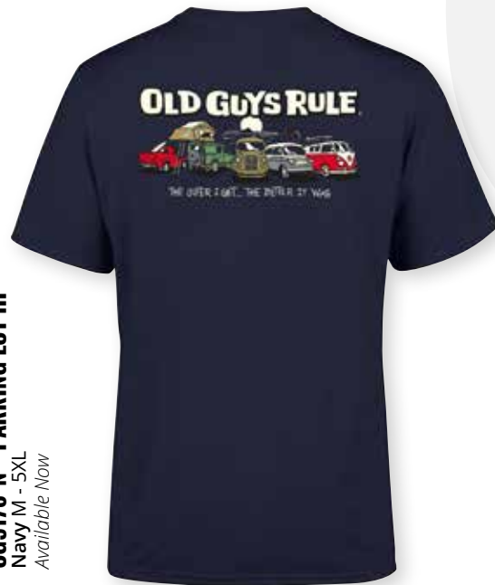
OG5178-N - PARKING LOT III Navy M - 5XL Available Now