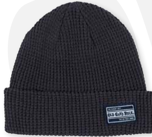
BNE010 - ORGANIC WAFFLE BEANIE Charcoal OSFM Available Now