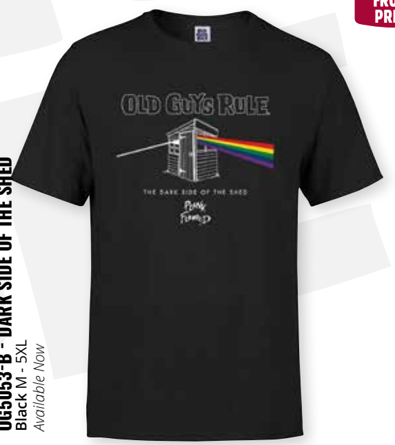
OG5053-B - DARK SIDE OF THE SHED Black M - 5XL Available Now