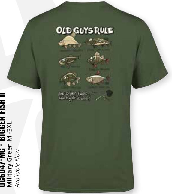
OG6047-MG - BIGGER FISH II Military Green M - 3XL Available Now