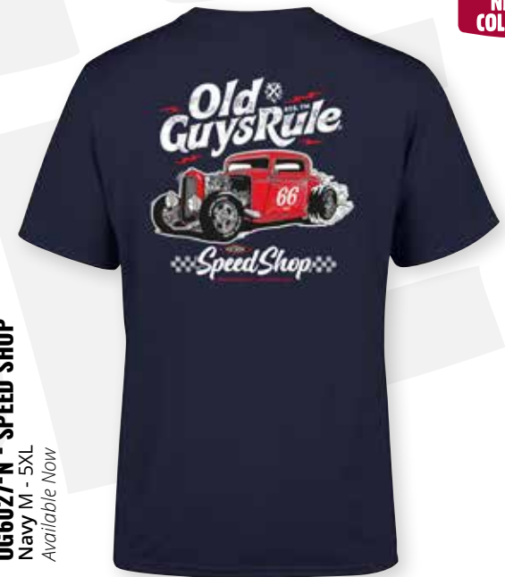
OG6027-N - SPEED SHOP Navy M - 5XL Available Now