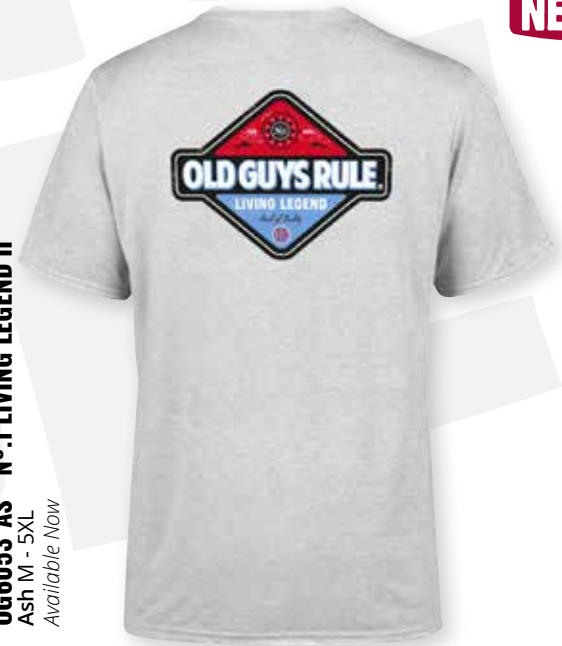
OG6053-AS - No.1 LIVING LEGEND II Ash M - 5XL Available Now