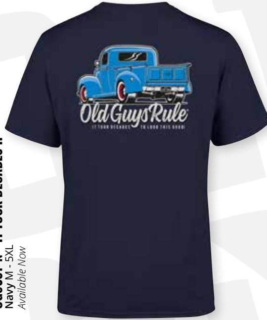
OG6031-N - IT TOOK DECADES II Navy M - 5XL Available Now