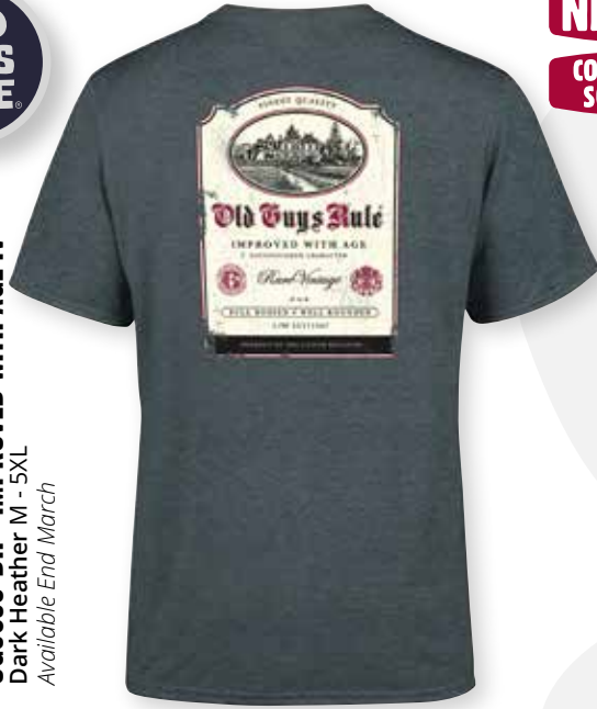
OG6058-DH - IMPROVED WITH AGE IV Dark Heather M - 5XL Available End March