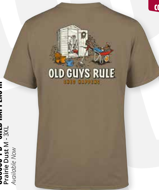
OG6030-PD - SHED HAPPENS III Prairie Dust M - 3XL Available Now