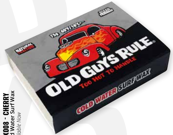
WAX008 - CHERRY Cold Water Surf Wax Available Now