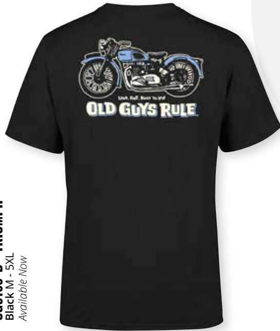
OG5168-B - TRIUMPH Black M - 5XL Available Now