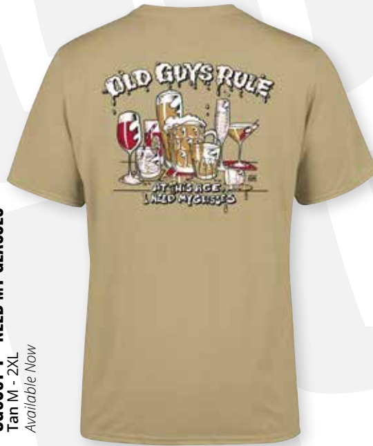
OG6051-T - NEED MY GLASSES Tan M - 2XL Available Now