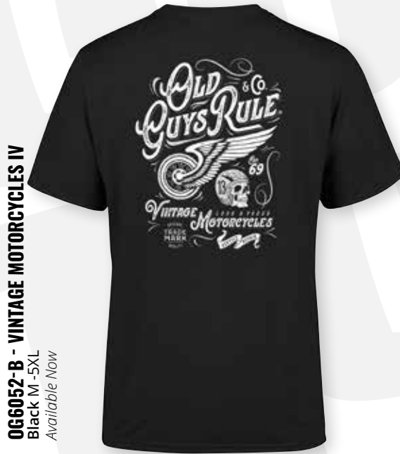
OG6052-B - VINTAGE MOTORCYCLES IV Black M - 5XL Available Now