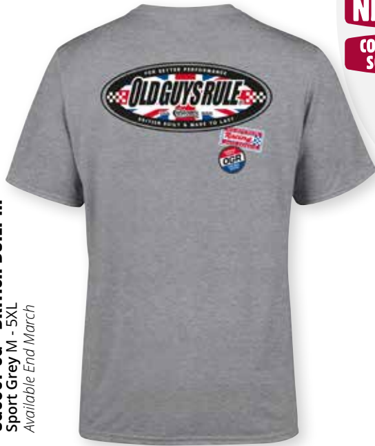
OG6061-SG - BRITISH BUILT III Sport Grey M - 5XL Available End March