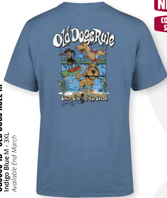
OG6060-IB - OLD DOGS RULE III Indigo Blue M - 3XL Available End March