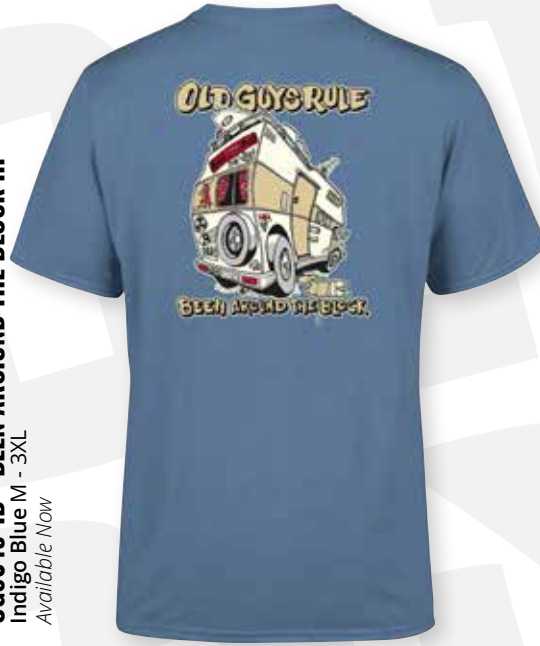
OG6049-IB - BEEN AROUND THE BLOCK III Indigo Blue M - 3XL Available Now