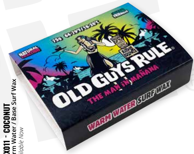
WAX011 - COCONUT Warm Water / Base Surf Wax Available Now