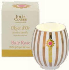
237-25 CANDLE pink pepper & rose

A fresh, revitalising, woody & spicy fragrance with top notes of pink pepper, leading to a heart of rose and geranium florals, and a base of warm, sweet amber.