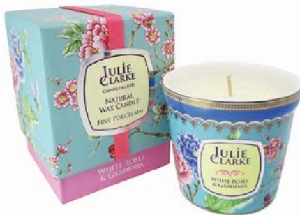
220-04 CANDLE WHITE ROSES & GARDENIA A romantic heart of White Roses is surrounded by the intoxicating floral notes of Gardenia.