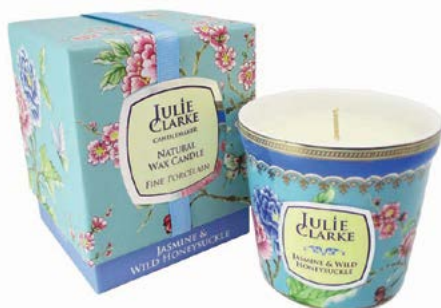
220-02 CANDLE JASMINE & WILD HONEYSUCKLE The sweet and fruity top notes of Honeysuckle are complimented by intense Jasmine heart notes.

Fresh and sweet Citrus top notes, a cleansing heart of Verbena, with a warm sweet base of Musk and Amber.