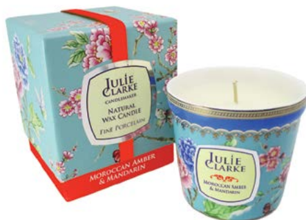
220-14 CANDLE MOROCCAN AMBER & MANDARIN A rich sultry fragrance with warm Moroccan Amber enriched with fresh Mandarin and touches of Cassis.