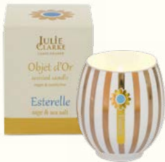
237-24 CANDLE sage & sea salt

A warm, sophisticated fragrance with top notes of sage and hints of bergamot leading to an invigorating heart of fresh ocean fragrances, smoothed by shades of musk and guaiac wood.