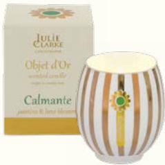
237-23 CANDLE jasmine & lime blossom

The refreshing and exhilarating top notes of lime blossom are complemented by an intense jasmine heart note, one of the foundation stones of fragrances.