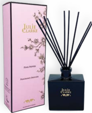
252-35 DIFFUSER with gold cork