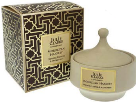
108-01 CANDLE MOROCCAN HARVEST Orange Flower & Mandarin