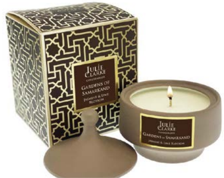
107-02 CANDLE GARDENS OF SAMARKAND Jasmine & Lime Blossom