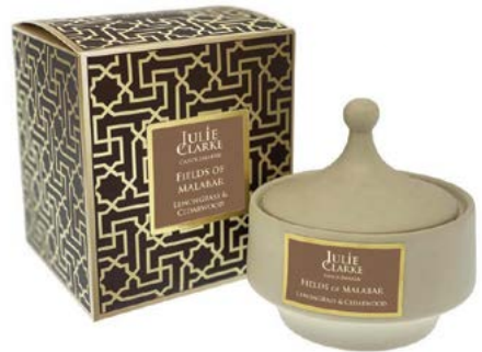
108-11 CANDLE FIELDS OF MALABAR Lemongrass & Cedarwood