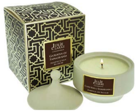
108-02 CANDLE GARDENS OF SAMARKAND Jasmine & Lime Blossom