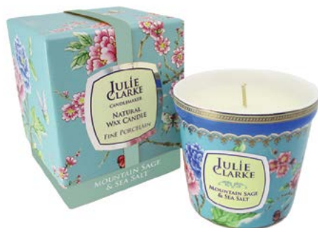
220-13 CANDLE MOUNTAIN SAGE & SEA SALT A warm sophisticated fragrance with top notes of Sage and an invigorating heart of Ocean fragrances.