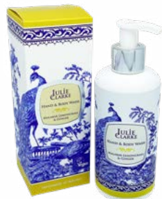
901-11 MALABAR LEMONGRASS & GINGER HAND & BODY WASH