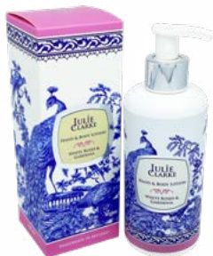
902-04 WHITE ROSES & GARDENIA HAND & BODY LOTION