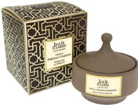
107-09 CANDLE FROM A PERSIAN GARDEN Fresh Fig & Apricot