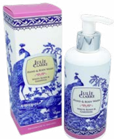
901-04 WHITE ROSES & GARDENIA HAND & BODY WASH