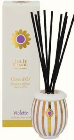
238-21 DIFFUSER violet & cedarwood