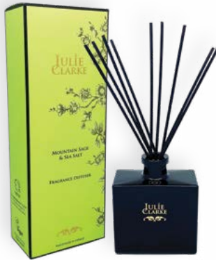
252-33 DIFFUSER with gold cork