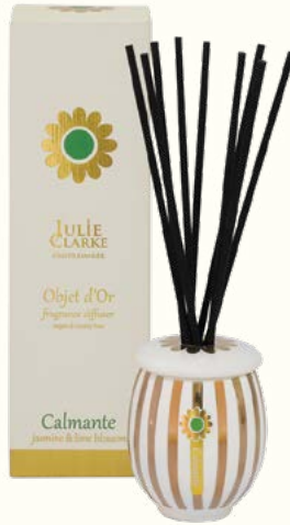
238-23 DIFFUSER jasmine & lime blossom