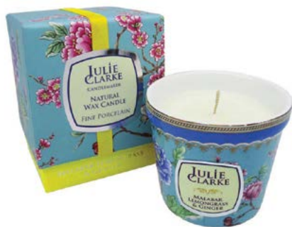
220-11 CANDLE MALABAR LEMONGRASS & GINGER Tangy Lemongrass blended with spicy Ginger creates an invigorating, zesty and spicy scent to lift your mood.