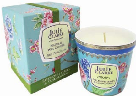
220-08 CANDLE PATCHOULI LEAVES & SANDALWOOD The earthy notes of Indian Patchouli are combined with woody notes of oriental Sandalwood.