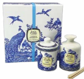
210211-02 CANDLE & DIFFUSER SET