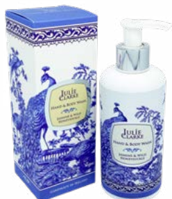
901-02 JASMINE & WILD HONEYSUCKLE HAND & BODY WASH

These superfruit hand & body washes gently cleanse your skin with moisturising botanicals, organic jojoba oil and glycerin. The natural emollients provide lipid relief to smooth and hydrate your skin. They are enriched with an antioxidant superfruit blend delivering vital nutrients, while supporting the skin's surface barrier.