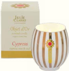
237-22 CANDLE cypress, rose & oud

A zesty burst of refreshing grapefruit dominates the top notes of Cypress, with the rich intensity of jasmine & rose at its heart, mixed with the warm sweetness and woody base notes of oud.