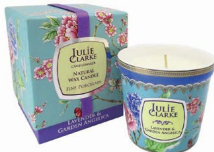
220-03 CANDLE LAVENDER & GARDEN ANGELICA Relaxing notes of soothing Lavender around a heart of healing Angelica from the herb garden.