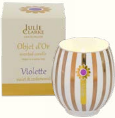
237-21 CANDLE violet & cedarwood

With warm, aromatic top notes of fresh spice, this musky fragrance is softened by heart notes of romantic violet, a very feminine scent, and intense, woody base notes of cedarwood.