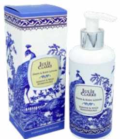
902-02 JASMINE & WILD HONEYSUCKLE HAND & BODY LOTION

These superfruit hand & body lotions are formulated with moisturising botanicals and a superfruit blend that slows down the loss of water from the skin. Organic jojoba and antioxidant cranberry seed oils help to repair your skin cells by forming a barrier on the surface, leaving your skin velvety soft.