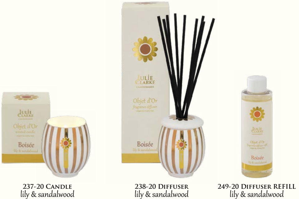
237-20 CANDLE lily & sandalwood

Infused with top notes of coconut, this classic woody fragrance adds richness, depth & elegance, with base notes of creamy, sensual sandalwood and heart notes of musky patchouli and intoxicating lily.