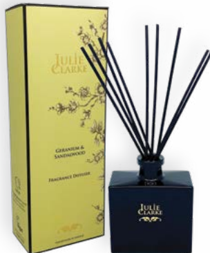
252-34 DIFFUSER with gold cork