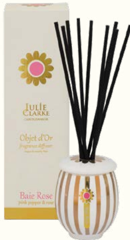
238-25 DIFFUSER pink pepper & rose