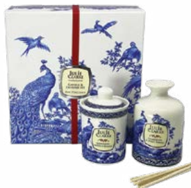
210211-07 CANDLE & DIFFUSER SET