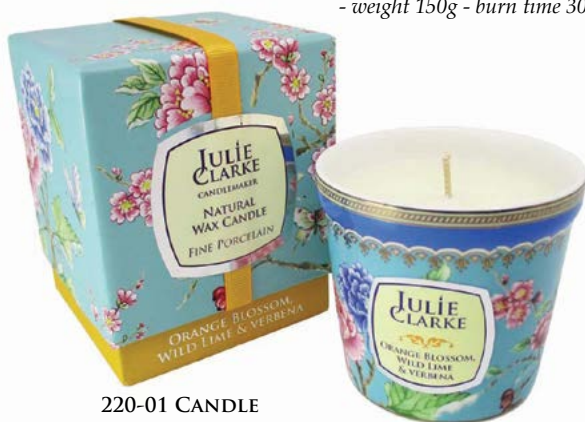
220-01 CANDLE ORANGE BLOSSOM, WILD LIME & VERBENA

Fresh and sweet Citrus top notes, a cleansing heart of Verbena, with a warm sweet base of Musk and Amber.