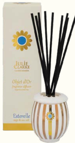
238-24 DIFFUSER sage & sea salt