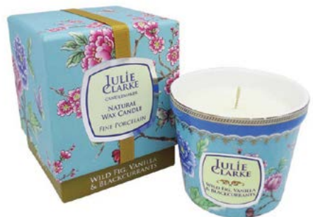
220-09 CANDLE WILD FIG, VANILLA & BLACKCURRANTS Fruity scented top notes of tangy Blackcurrant, a Mediterranean heart of milky sweet Fig and a sweet base of Vanilla.