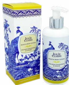
902-11 MALABAR LEMONGRASS & GINGER HAND & BODY LOTION