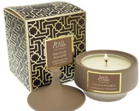
107-11 CANDLE FIELDS OF MALABAR Lemongrass & Cedarwood