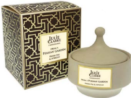
108-09 CANDLE FROM A PERSIAN GARDEN Fresh Fig & Apricot