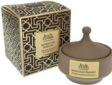
107-01 CANDLE MOROCCAN HARVEST Orange Flower & Mandarin

in brown stoneware pots - weight 230g - burn time 50 hours