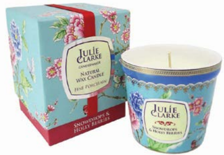
220-07 CANDLE SNOWDROPS & HOLLYBERRIES The winter notes of Cinnamon and Hollyberries give way to the fresh spring music of cool Snowdrops.