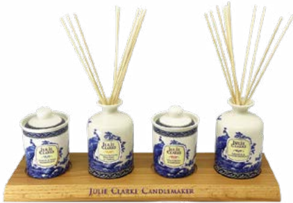
WOODEN PLINTH FOR TESTERS