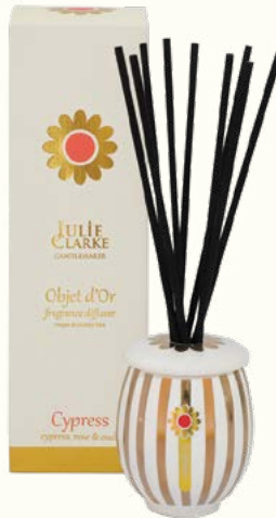
238-22 DIFFUSER cypress, rose & oud