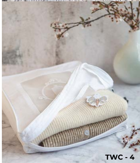
TWC - 4