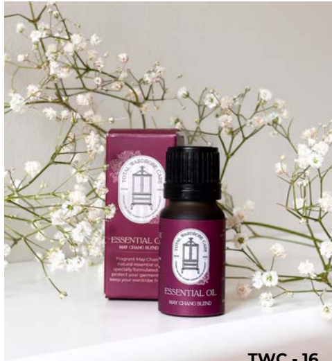
TWC - 16