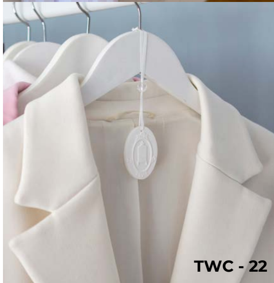
TWC - 22