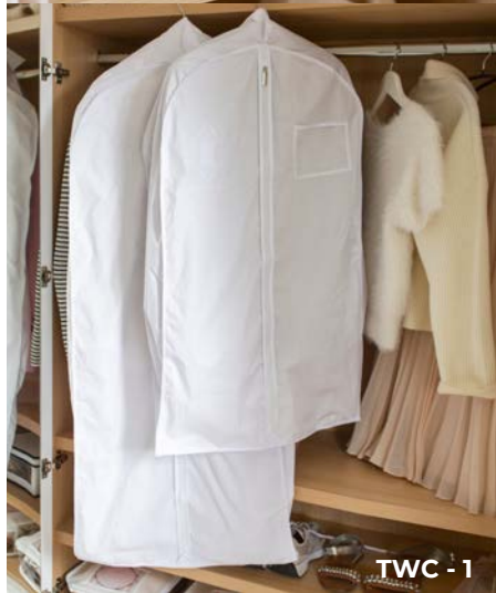
TWC - 1

Our clothing storage solutions are perfect for the protection, longevity and sustainability of your clothes