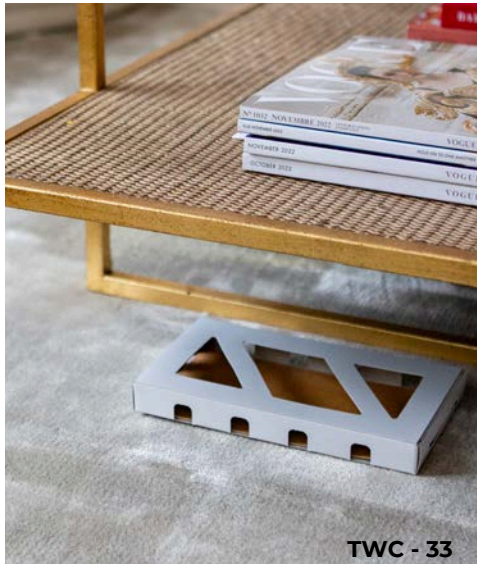
TWC - 33