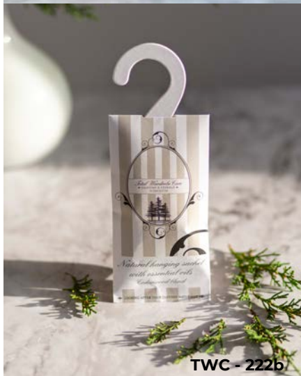
TWC - 222b