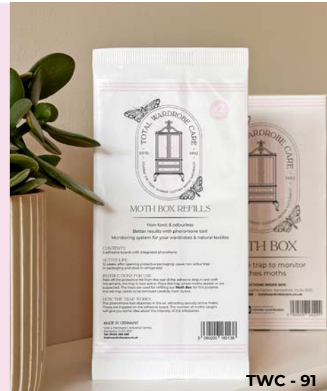
TWC - 91