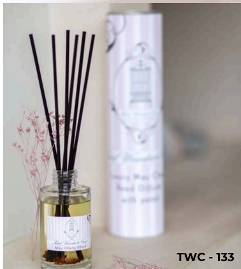
TWC - 133