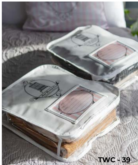
TWC - 39