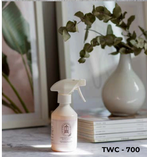
TWC - 700