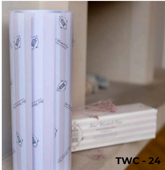
TWC - 24