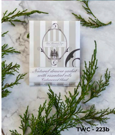
TWC - 223b