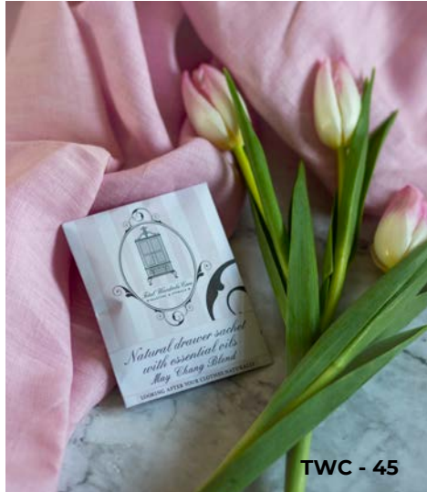
TWC - 45