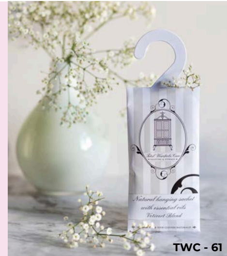
TWC - 61