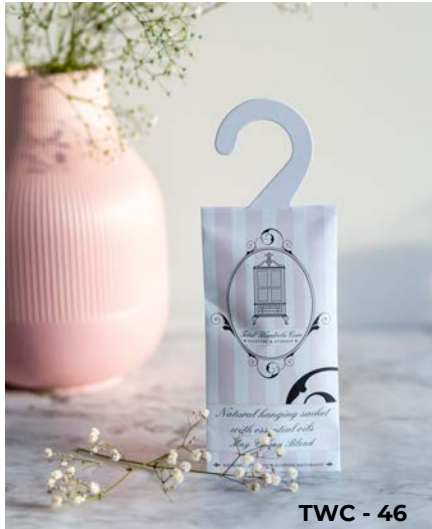
TWC - 46