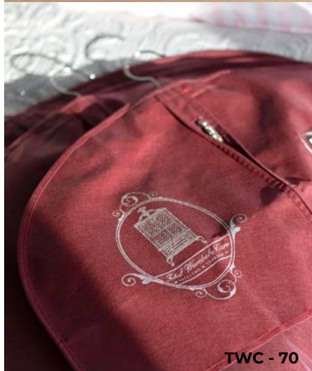
TWC - 70