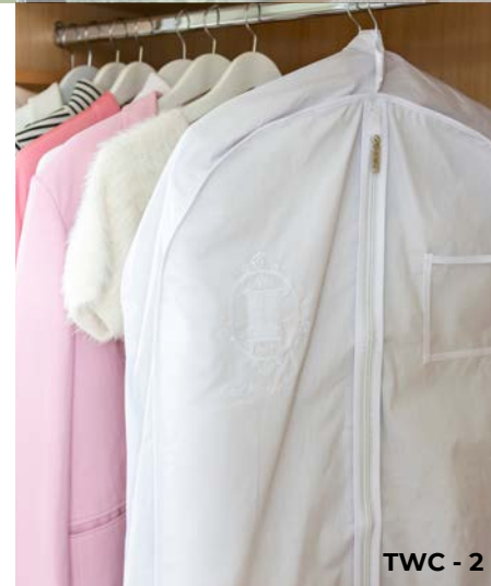
TWC - 2