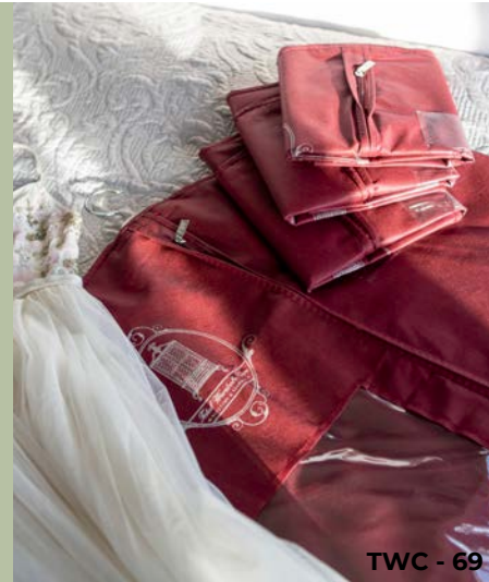
TWC - 69