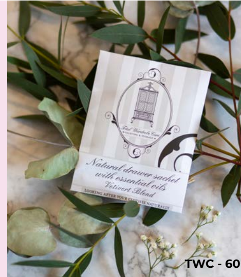
TWC - 60