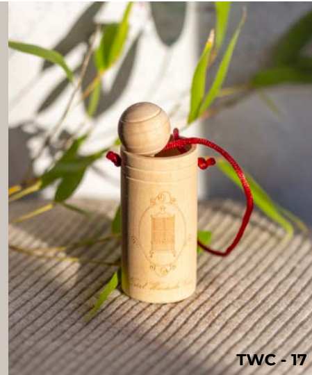
TWC - 17