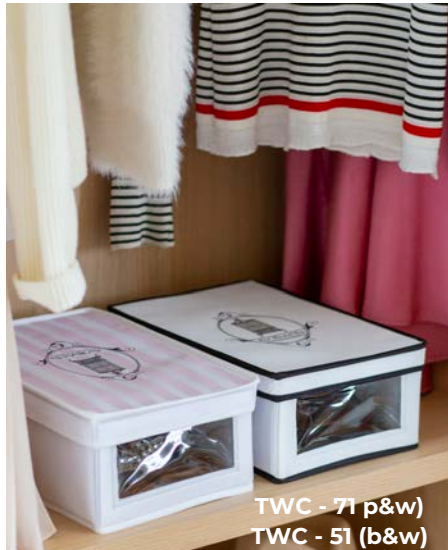
TWC - 71 p&w) TWC - 51 (b&w)