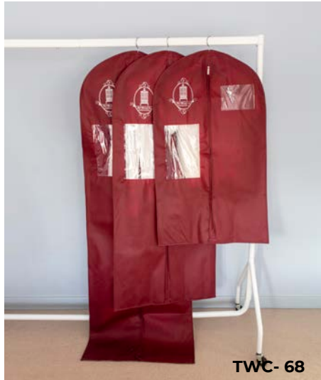
TWC - 68