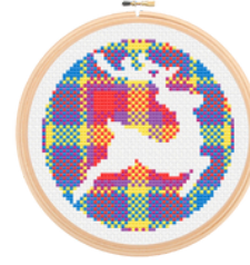
RODDY THE REINDEER ENCIRCLED/ WS 310