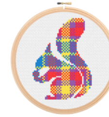
SANDY THE SQUIRREL/ WS 317