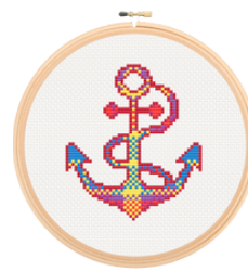
SCOTTISH ANCHOR / WS 325