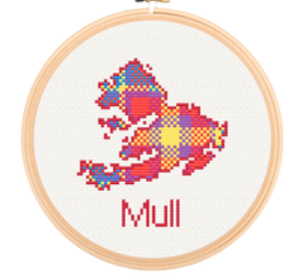
ISLE OF MULL / WS 327