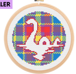
LOCH NESSIE ENCIRCLED/ WS 318