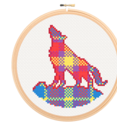
DOUGLAS THE WOLF / WS 332