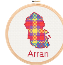
ISLE OF ARRAN / WS 326