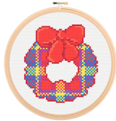
STASH TARTAN WREATH/ WS 313