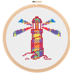
LIGHTHOUSE/ WS 314