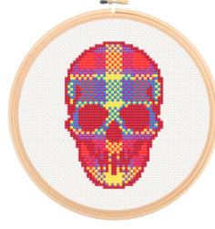
WILLIAM THE SKULL / WS 330