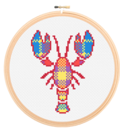
LARRY LOBSTER / WS 323