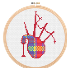
BAGPIPES/ WS 320