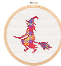
AGNES THE WITCH / WS 331