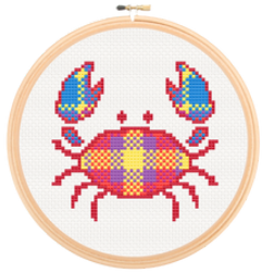
CALLUM CRAB / WS 322