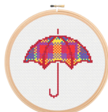
SCOTTISH BROLLY/ WS 321

ALL KITS ARE PRICED AT: TRADE £9 RRP £18-22