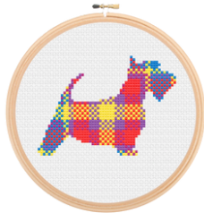
BLAIR THE SCOTTIE DOG/ WS 308