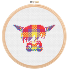
HARRIS THE HIGHLAND COW/ WS 301