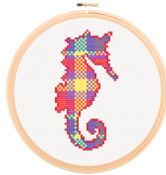
SINCLAIR SEAHORSE / WS 324