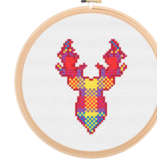
ANDREW THE STAG/ WS 305