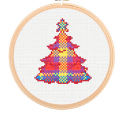
CHRISTMAS TREE/ WS 312