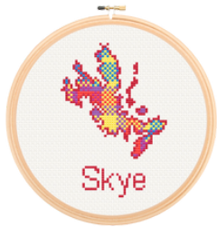
ISLE OF SKYE / WS 328