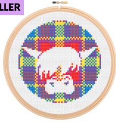
HARRIS THE HIGHLAND COW ENCIRCLED/ WS 302