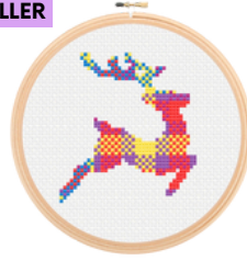
RODDY THE REINDEER/ WS 309