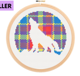
DOUGLAS THE WOLF ENCIRCLED / WS 333

ALL KITS ARE PRICED AT: TRADE £9 RRP £18-22