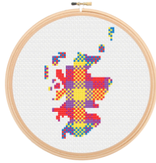
SCOTLAND/ WS 307