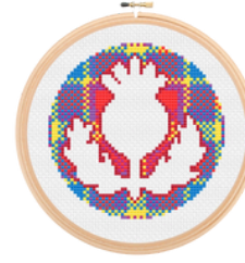
BARB THE THISTLE ENCIRCLED/ WS 304