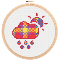
SCOTTISH WEATHER/ WS 319