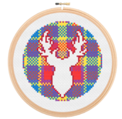
ANDREW THE STAG ENCIRCLED/ WS 306