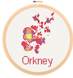
ORKNEY / WS 329