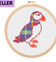
ARCHIBALD THE PUFFIN/ WS 316