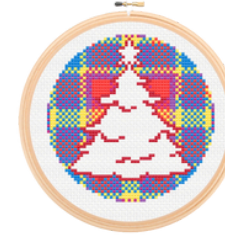
CHRISTMAS TREE ENCIRCLED/ WS 311