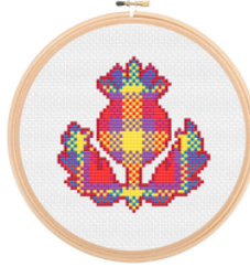
BARB THE THISTLE/ WS 303