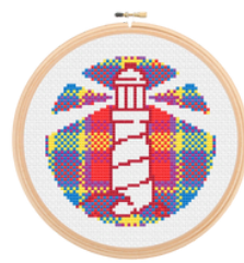
LIGHTHOUSE ENCIRCLED/ WS 315