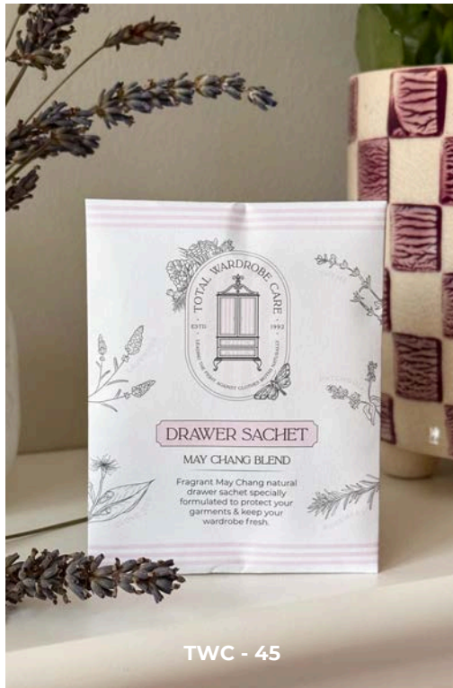
TWC - 45