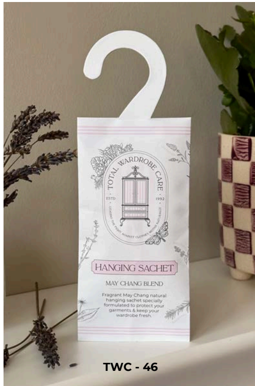
TWC - 46