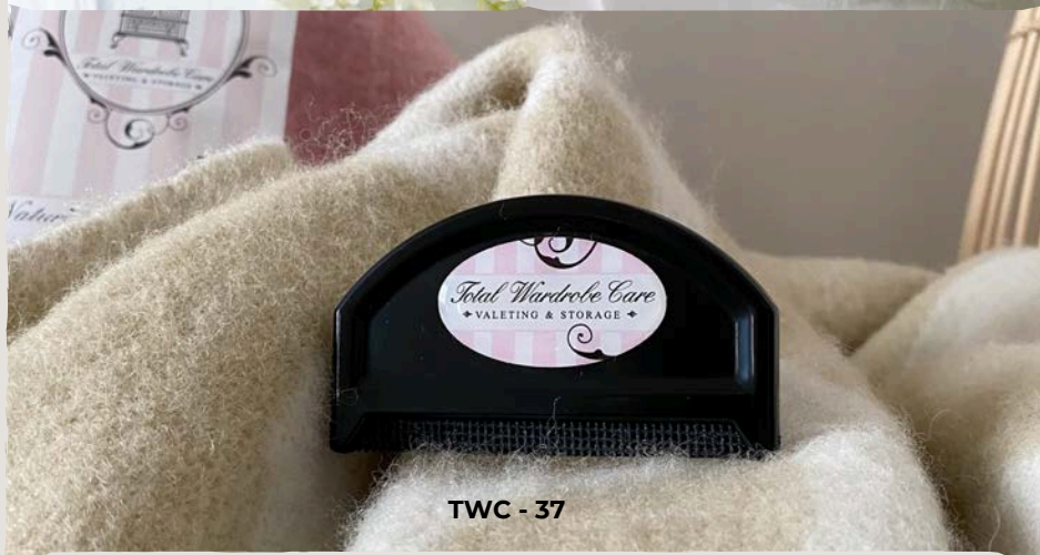
TWC - 37

Offer your customers a premium laundry product that cares for their precious garments while aligning with sustainable values.