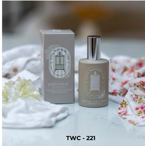
TWC - 221