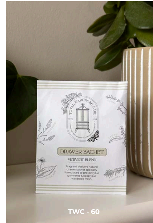
TWC - 60

Our Drawer Sachets offer an effective, natural solution for moth protection and freshness in drawers, closets, and storage. Designed to keep textiles safe and smelling great, they provide up to 3 months of long-lasting protection.