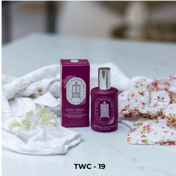
TWC - 19