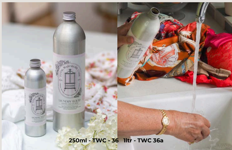
250ml - TWC - 36 1ltr - TWC 36a