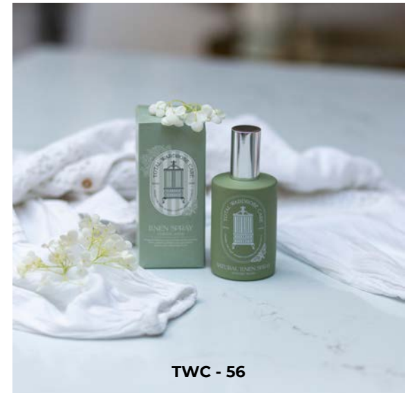
TWC - 56

Our Anti-Moth Linen Sprays offer an effective, natural solution for keeping all fabrics and soft furnishings, including silk, fresh and protected from moths. Infused with carefully selected essential oils, these sprays are perfect for everyday use, not just for moth prevention, leaving textiles with a long-lasting, delightful fragrance while maintaining their freshness.