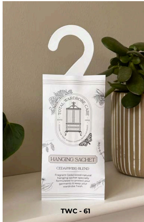
TWC - 61