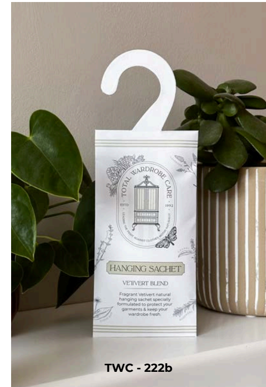
TWC - 222b

Our Hanging Sachets offer a natural, eco-friendly solution for moth protection, keeping wardrobes and drawers fresh while safeguarding textiles. Easy to use, they provide long-lasting freshness for up to 3 months, preventing moth damage to clothing, rugs, and more.