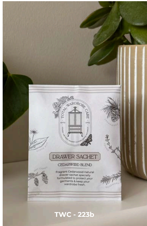
TWC - 223b