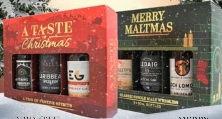
A TASTE OF Christmas