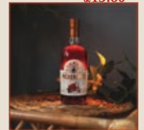
Pickering's Sloe Gin

A festive twist on our Pickering's Gin, with sloe berries and cinnamon for a balanced, warming drink featuring cherry bakewell and zesty lemon notes.