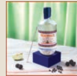
Pickering's Gin with Scottish Botanical's

Over the past decade, we've mastered the art of botanical engineering, producing award-winning gins with an exceptionally smooth finish. Making Pickering's the perfect choice for any occasion.