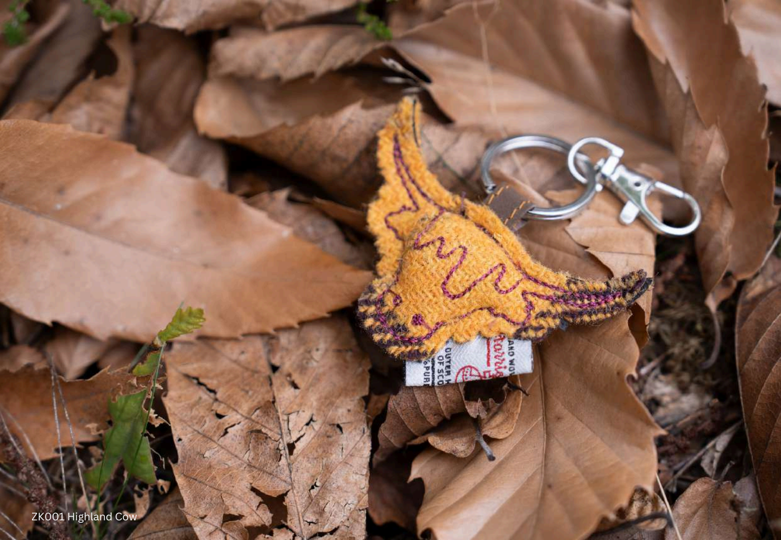
ZK001 Highland Cow