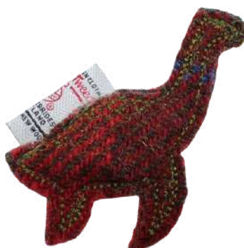
ZK003 Harris Tweed Fridge Magnet