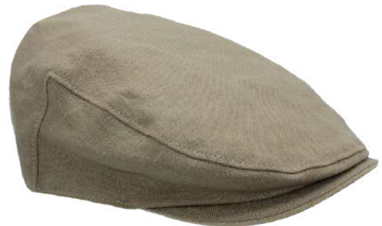
ZH288 Larne Irish Linen Flat Cap