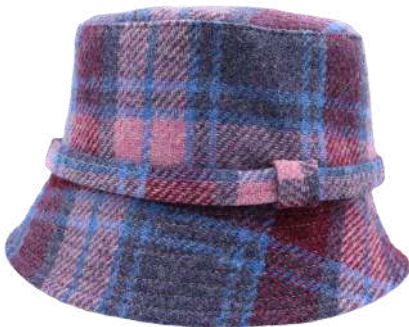
Forget Me Not