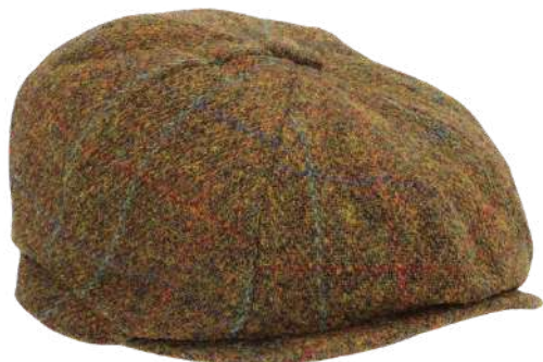
ZH293 Brodick Harris Tweed 8-Piece Cap