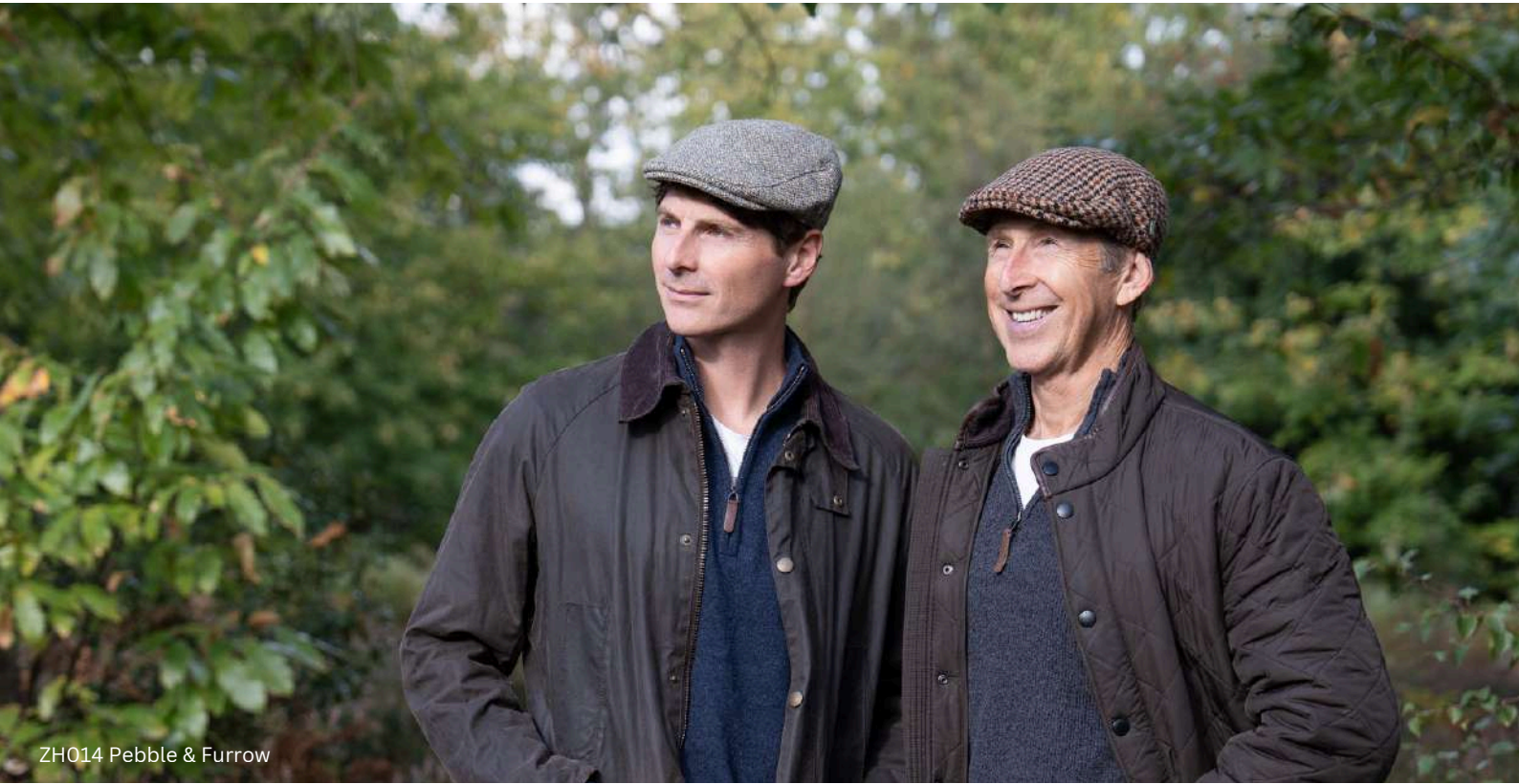
ZH014 Pebble & Furrow