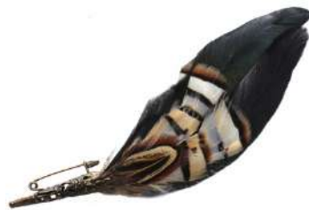
ZF022 approx 17cm