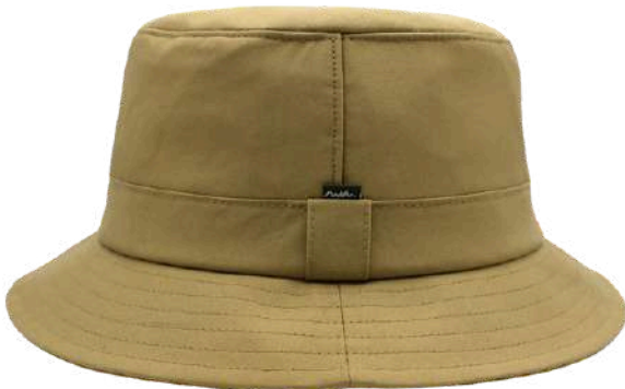
ZH292 Nairn Waterproof British Cotton Bucket Hat