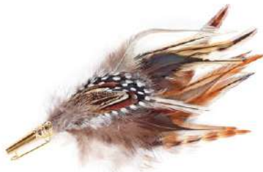
ZF020 approx 17cm