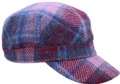
Forget me not