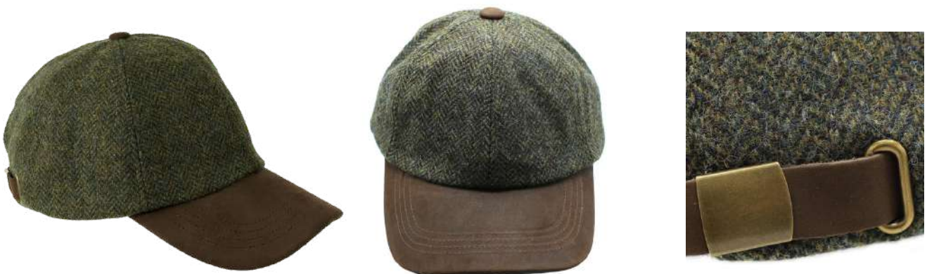
ZH105 Sutton Tweed Baseball Cap in 'Pine'