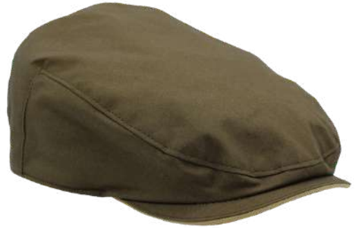
ZH291 Tarbert Waterproof British Cotton Flat Cap