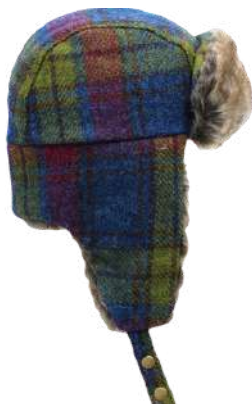
ZH297 Islay Ladies Harris Tweed Trapper Hat