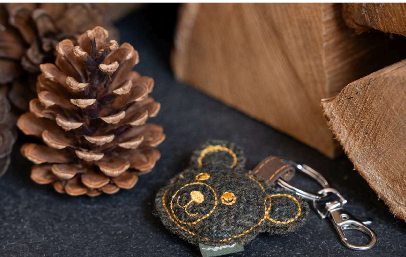
ZK002 Teddy Bear