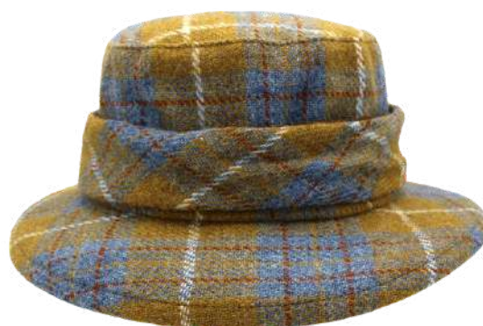
ZH296 Melrose Ladies Harris Tweed Hat