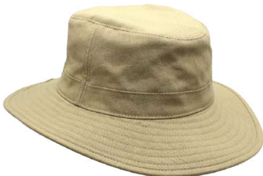
ZH289 Rathlin Irish Linen Explorer Hat