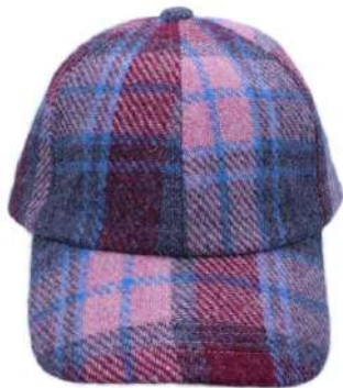
Forget me not