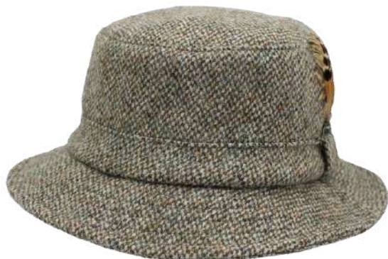
ZH295 Whithorn Harris Tweed Grouse Hat