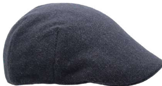
ZH294 Rockcliffe Harris Tweed Duckbill Cap