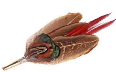
ZF018 approx 15cm