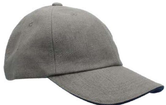
ZH287 Dromore Irish Linen Baseball Cap