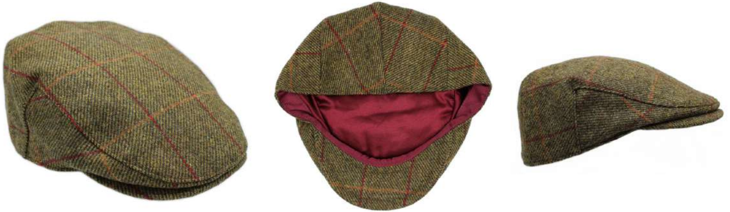
ZH097 Kinloch Waterproof Tweed Cap in 'Hawthorn'