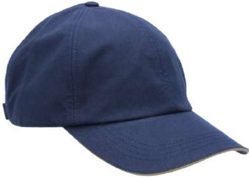
ZH290 Thurso Waterproof British Cotton Baseball Cap