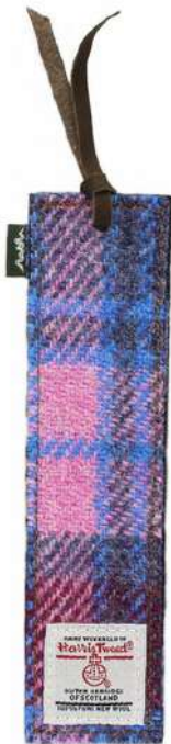
Forget Me Not