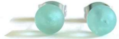
Opal Frosted Mini Studs £2.80 (£7 RRP)