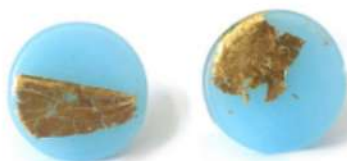
Gold Ice Blue