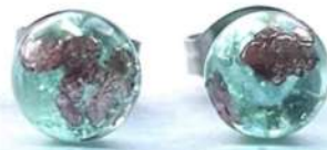
Opal Palladium Mini Studs £2.80 (£7 RRP)