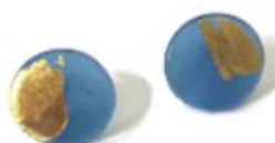
Gold Slate Blue