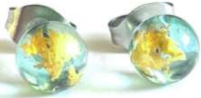
Opal Gold Mini Studs £2.80 (£7 RRP)

Coming from pale blue bottles the glass has a gorgeous turquoise finish once it has been flameworked, available in three finishes of Mini studs and three pendants on Sterling Silver chain.