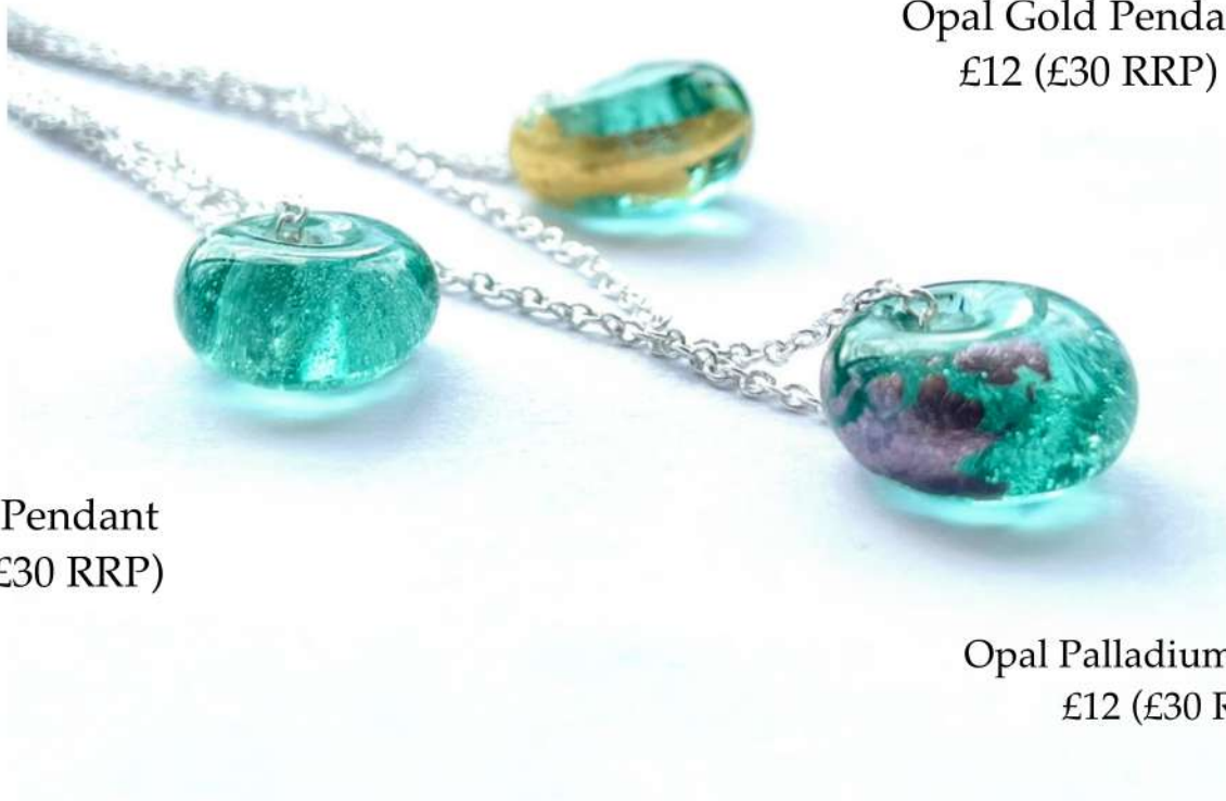
Opal Gold Pendant £12 (£30 RRP)