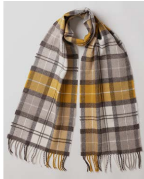
WWS795/004 Aurora Mustard