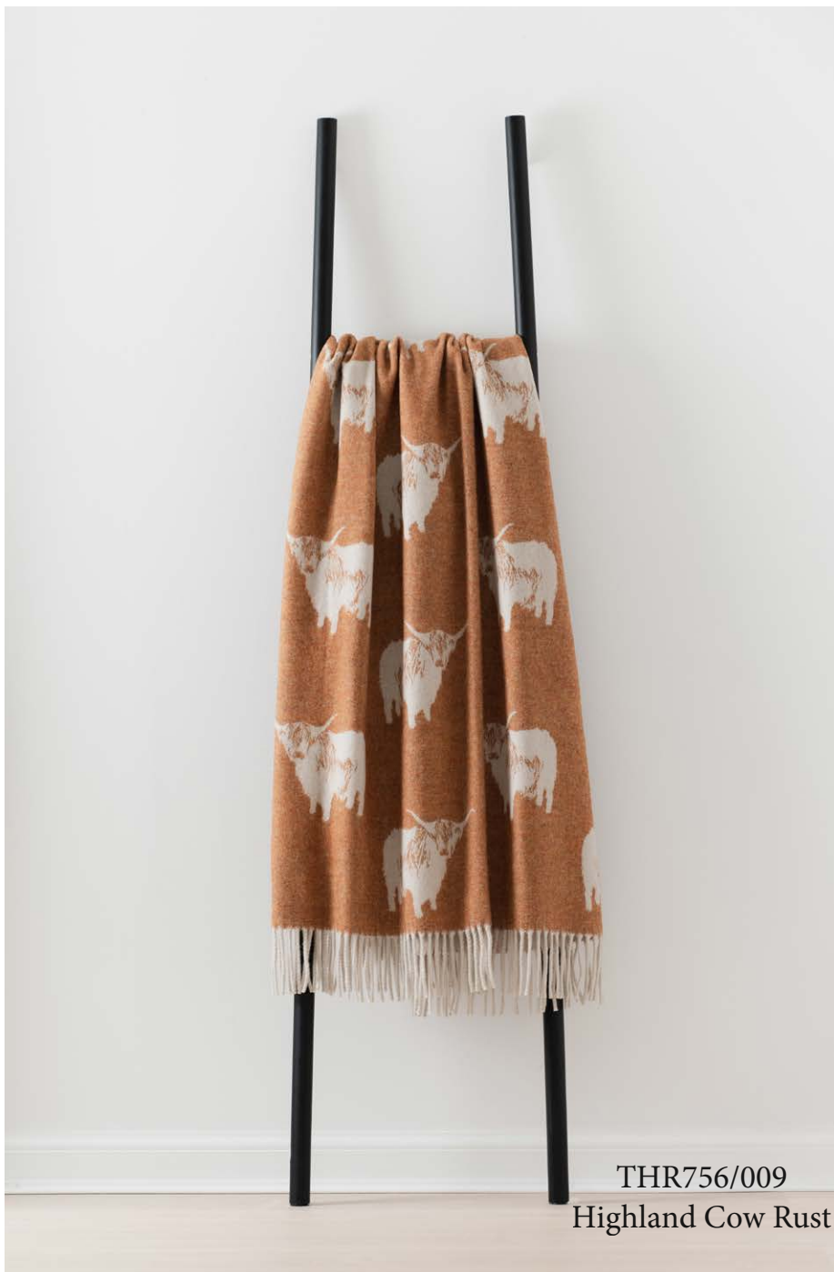
THR756/009 Highland Cow Rust