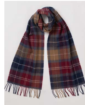
TS876/005 Aurora Wine