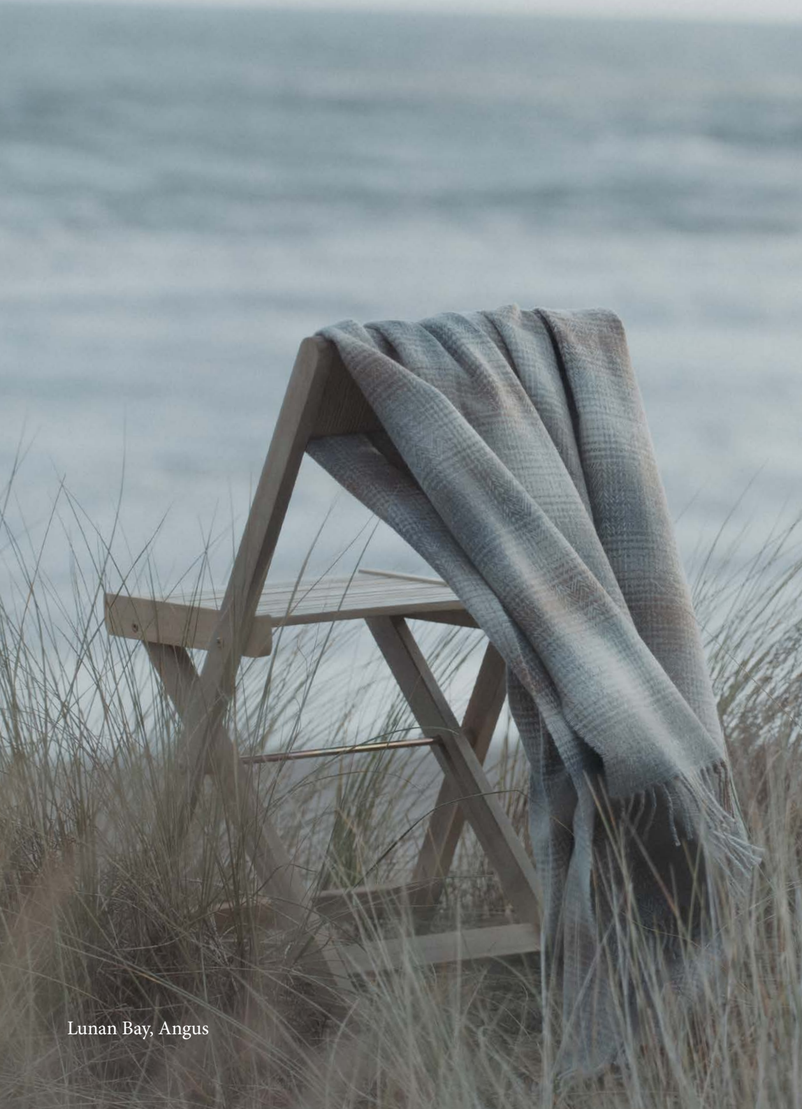
Lunan Bay, Angus