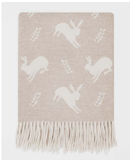
THR756/007 Hare Fawn