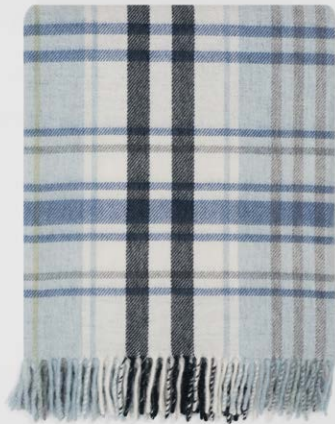
THR861/005 Sea Blue