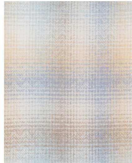
THR880/001/SPT Lunan Shore