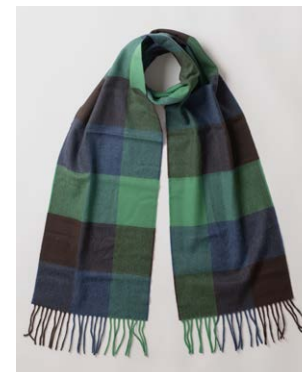
WWS778/003 Bazaar Lantern