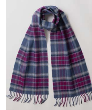
WWS795/204 Skara Brae Sapphire