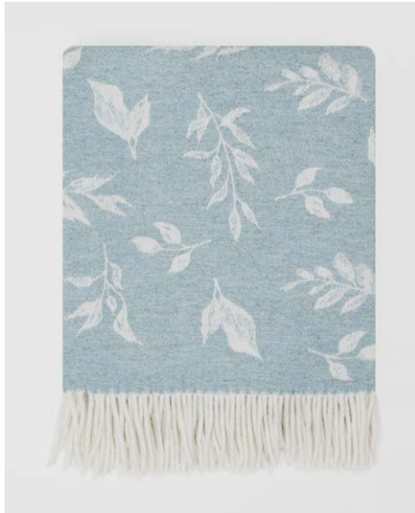
THR756/018 Leaf Topaz