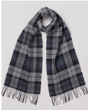
TS876/105 Tartans Uniform Grey