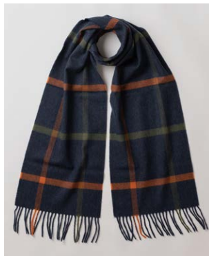
WWS778/102 Roti Jean