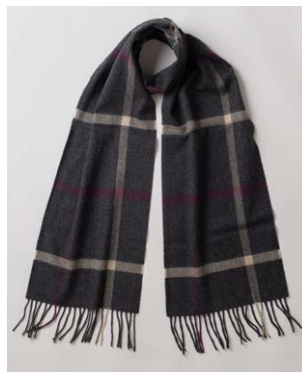
WWS778/103 Roti Betsy