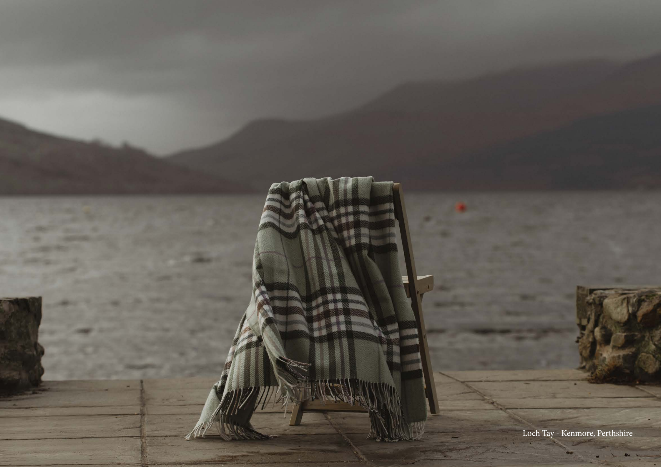
Loch Tay - Kenmore, Perthshire