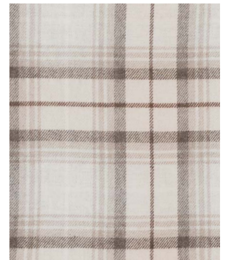
THR881/004/SPT Lindores Mushroom