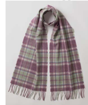
WWS795/205 Skara Brae Opal