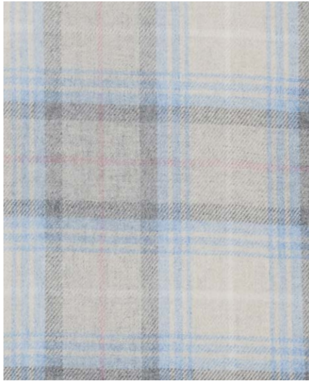
THR881/006/SPT Lindores Cornflower