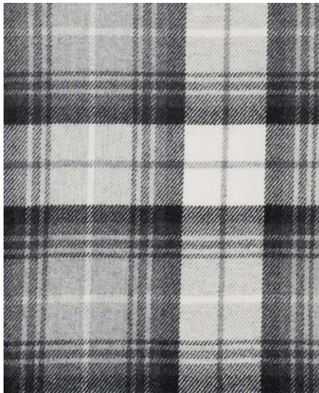
THR881/007/SPT Lindores Slate