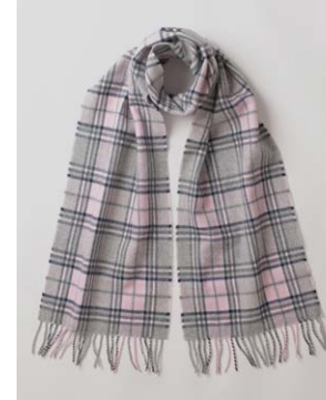
WWS795/201 Skara Brae Rose Quartz