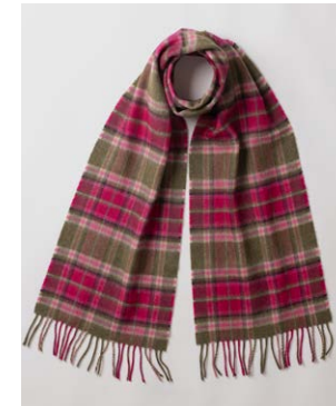
WWS795/203 Skara Brae Ruby