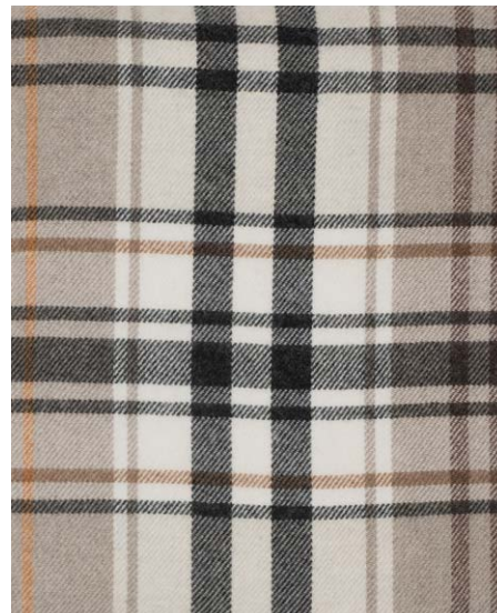
THR879/004/SPT Pitnacree Stone