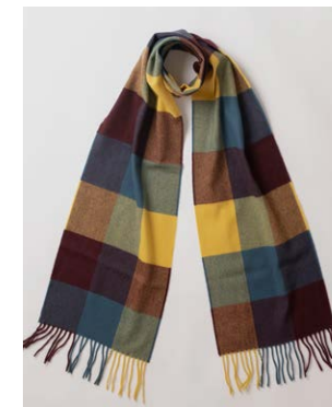
WWS778/004 Bazaar Storm

90% merino lambswool / 10% cashmere ~ 30cm x 200cm, including purled fringe