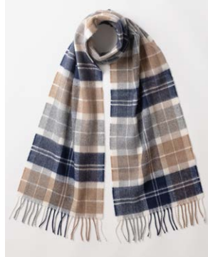
WWS795/003 Aurora Classic