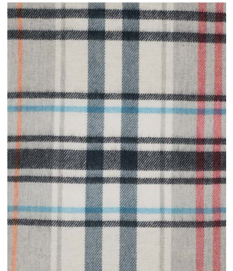
THR879/006/SPT Pitnacree Rose