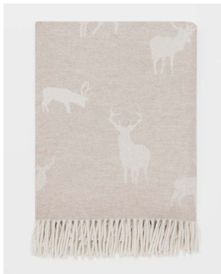
THR756/002 Stag Fawn