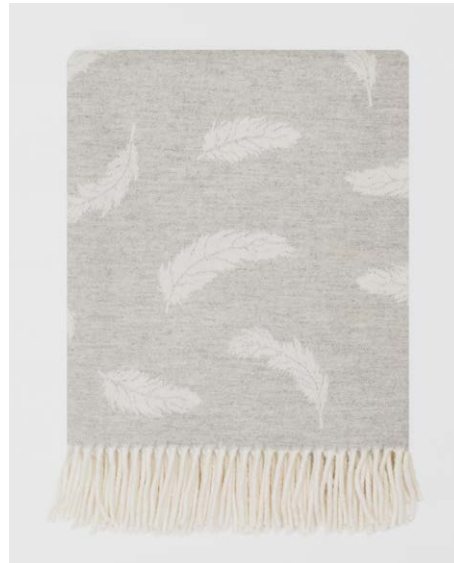
THR756/040 Feather Silver