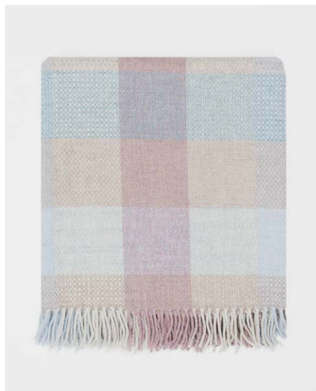
THR831/002 Sea Breeze