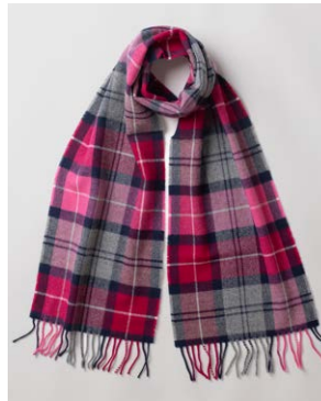
WWS795/001 Aurora Cerise