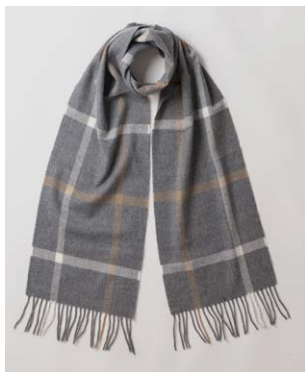
WWS778/101 Roti Rogue