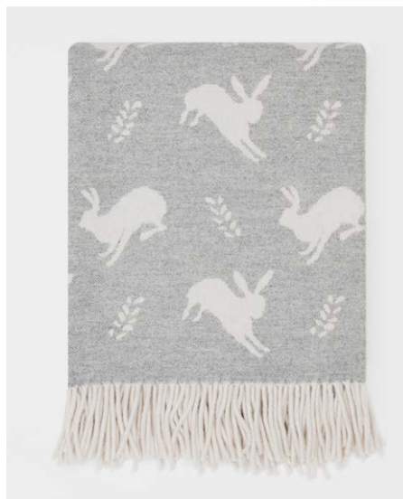
THR756/001 Hare Grey