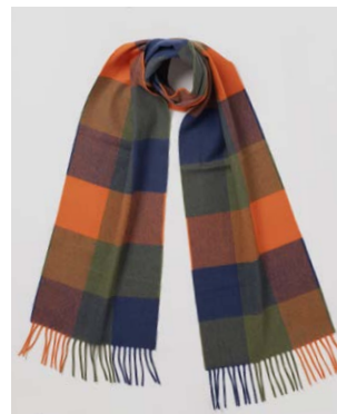
WWS778/002 Bazaar Starfire