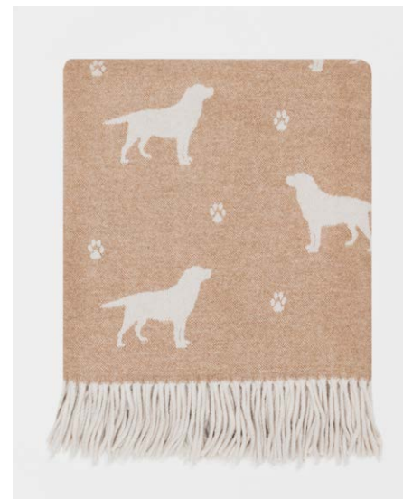
THR756/003 Labrador Bran