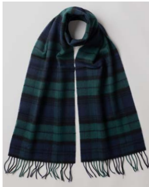
WWS795/101 Tartans Black Watch