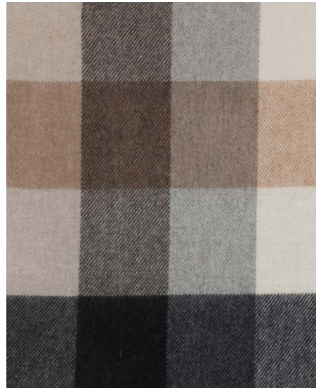
THR879/001/SPT Dunira Natural