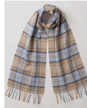
WWS795/202 Skara Brae Blue Stone