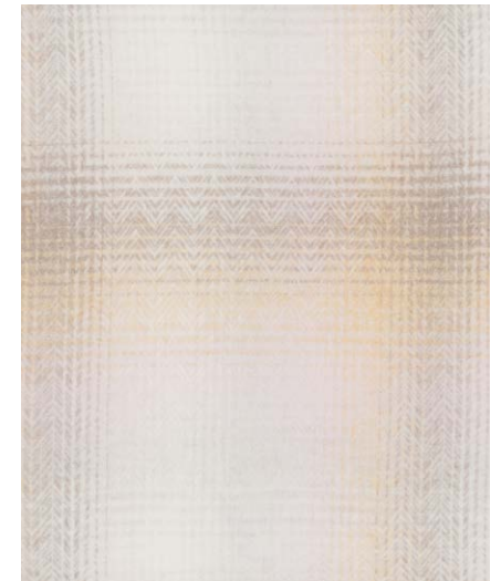
THR880/003/SPT Lunan Sands