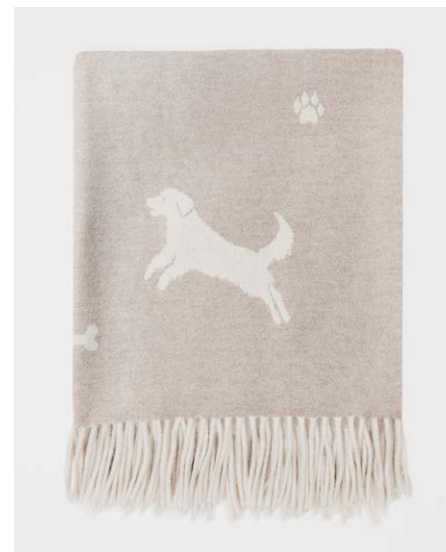
THR756/027 Multi Dog Fawn