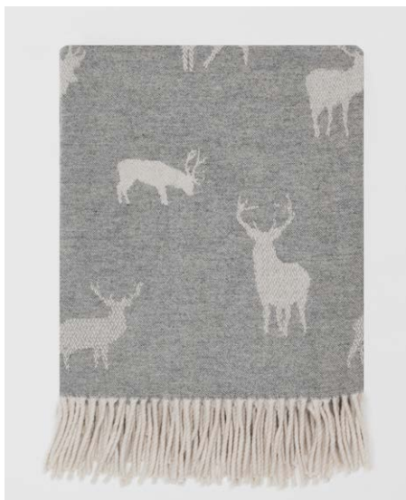
THR756/006 Stag Grey