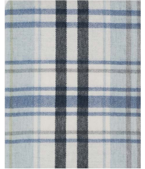
THR879/005/SPT Pitnacree Sea Blue