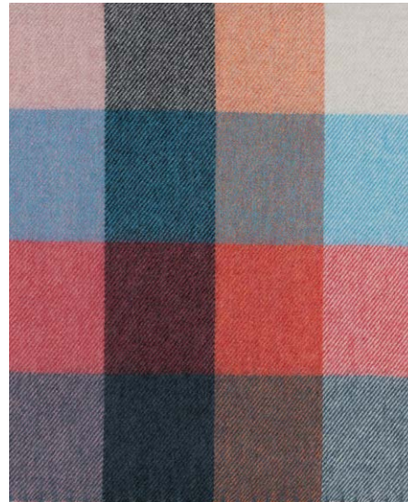
THR879/003/SPT Dunira Sorbet