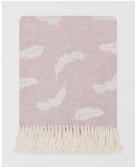
THR756/017 Feather Blossom