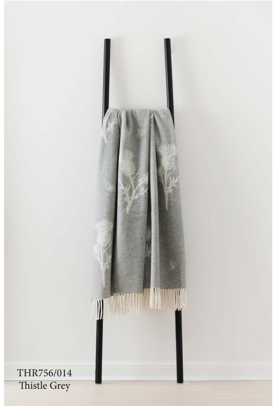
THR756/014 Thistle Grey