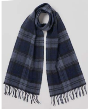
TS876/104 Tartans Admiral Navy