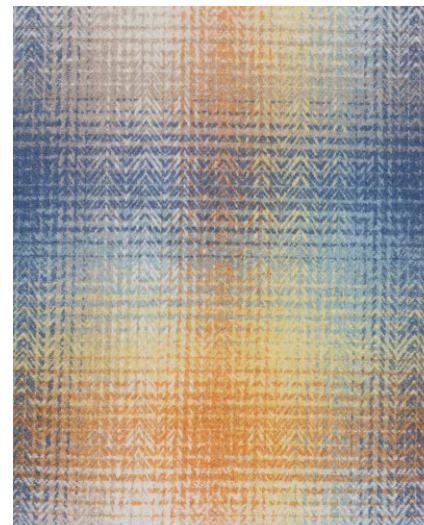
THR880/002/SPT Lunan Bay