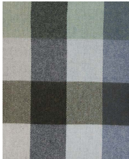
THR879/002/SPT Dunira Topaz