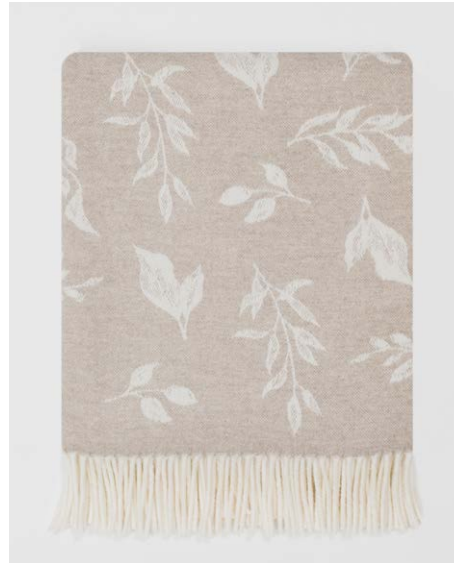
THR756/039 Leaf Oatmeal