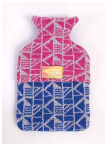
COLWAY 2 - TAHITI BLUE AND PEARL GREY FRONT WITH BUBBLEGUM PINK CONTRAST BACK