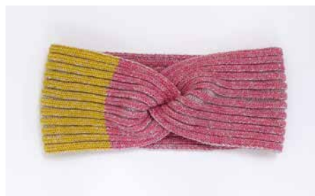
COLWAY 3 - NOUGAT PINK, PEARL GREY AND PICCALILLI YELLOW