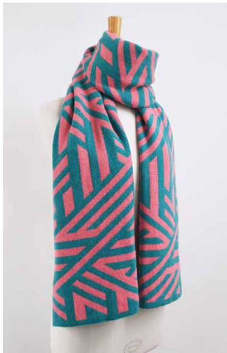
COLWAY 1 - LIPSTICK PINK AND SHAMROCK GREEN

100% LAMBSWOOL SCARVES, FULLY REVERSIBLE MEASURES APPROX. 195 X 35CMS