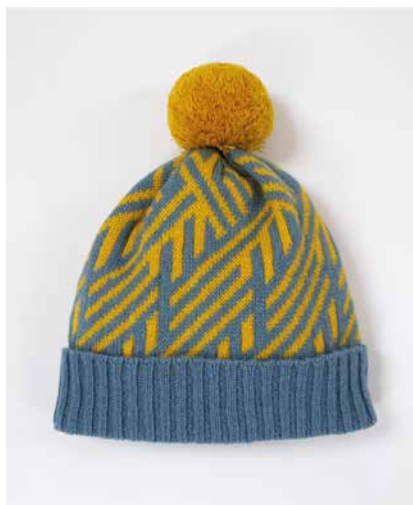
COLWAY 2 - PICCALILLI YELLOW AND PETREL GREY