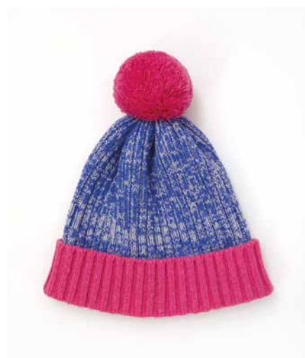
COLWAY 2 - TAHITI BLUE, PEARL GREY AND BUBBLEGUM