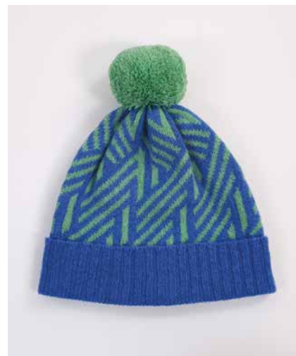
COLWAY 3 - SPRINGTIME GREEN AND TAHITI BLUE