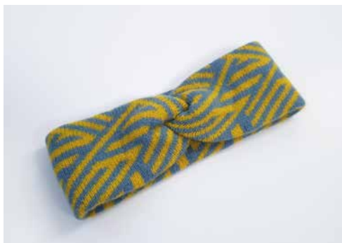
COLWAY 2 - PICCALILLI YELLOW AND PETREL GREY