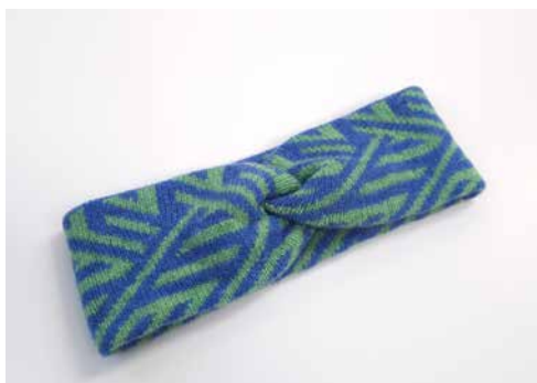
COLWAY 3 - SPRINGTIME GREEN AND TAHITI BLUE