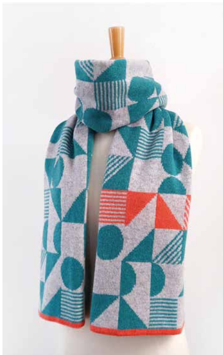
COLWAY 1 - SHAMROCK GREEN, PEARL GREY AND CORAL

100% LAMBSWOOL SCARVES, FULLY REVERSIBLE MEASURES APPROX. 180 X 30CMS