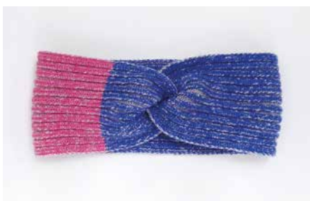
COLWAY 2 - TAHITI BLUE, PEARL GREY AND BUBBLEGUM