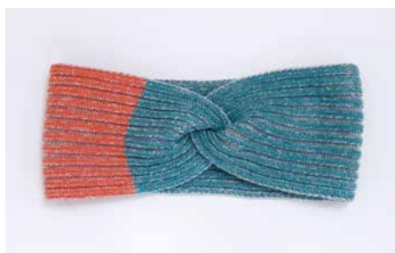
COLWAY 1 - SHAMROCK GREEN, PEARL GREY AND CORAL

100% LAMBSWOOL HEADBAND, KNITTED IN 2 X 2 RIB IN 4PLY YARN WITH TWIST DETAIL MEASURES APPROX. 45CMS IN DIAMETER, 10CMS IN WIDTH