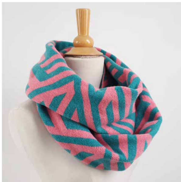
COLWAY 1 - LIPSTICK PINK AND SHAMROCK GREEN

100% LAMBSWOOL SNOODS, FULLY REVERSIBLE MEASURES APPROX. 150 X 35CMS