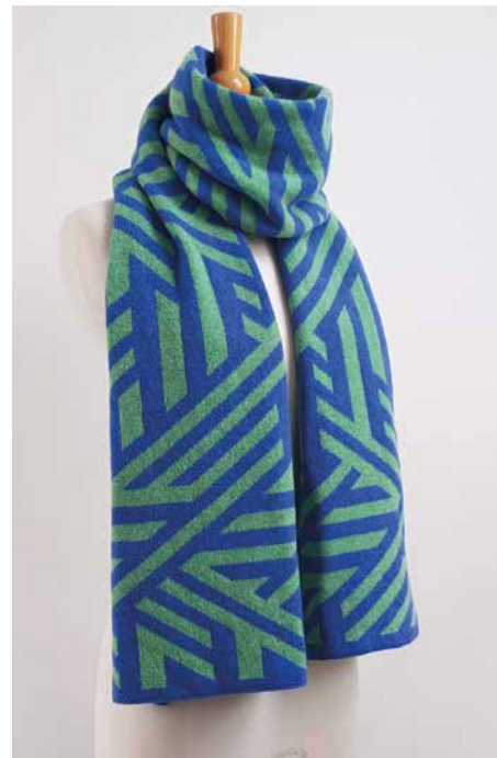
COLWAY 3 - SPRINGTIME GREEN AND TAHITI BLUE