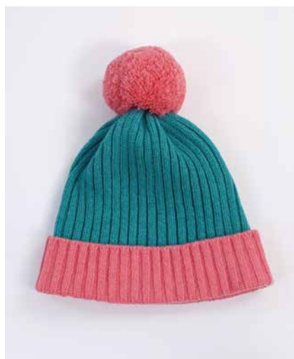
COLWAY 1 - LIPSTICK PINK AND SHAMROCK GREEN

100% LAMBSWOOL BEANIE, KNITTED IN 2 X 2 RIB IN 4PLY YARN MEASURES APPROX. 21 X 25CMS WITH POM