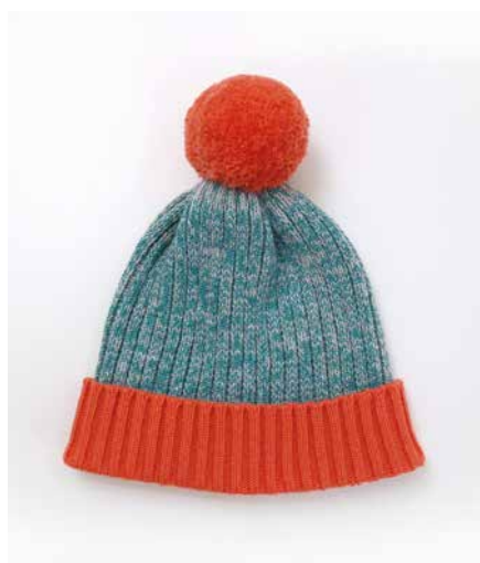
COLWAY 1 - SHAMROCK GREEN, PEARL GREY AND CORAL

100% LAMBSWOOL BEANIE, KNITTED IN 2 X 2 RIB IN 4PLY YARN MEASURES APPROX. 21 X 25CMS WITH POM