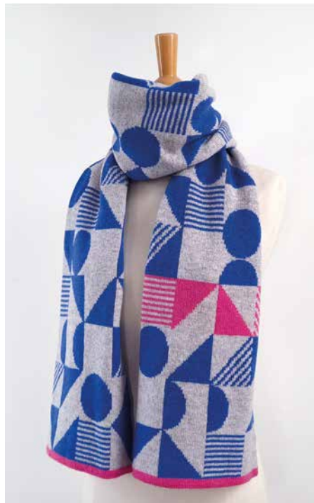
COLWAY 2 - TAHITI BLUE, PEARL GREY AND BUBBLEGUM