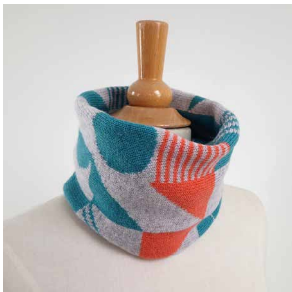
COLWAY 1 - SHAMROCK GREEN, PEARL GREY AND CORAL

100% LAMBSWOOL SNOODS, FULLY REVERSIBLE MEASURES APPROX. 52 X 30CMS