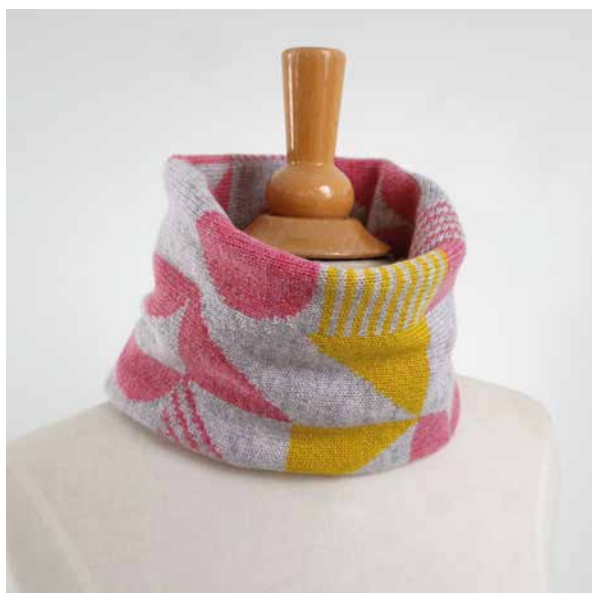
COLWAY 3 - NOUGAT PINK, PEARL GREY AND PICCALILLI YELLOW