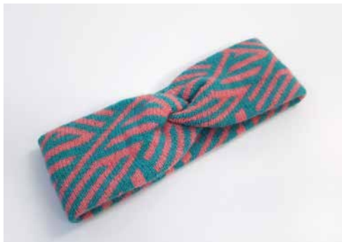
COLWAY 1 - LIPSTICK PINK AND SHAMROCK GREEN

100% LAMBSWOOL HEADBAND WITH TWIST DETAIL MEASURES APPROX. 48CMS IN DIAMETER, 8CMS IN WIDTH