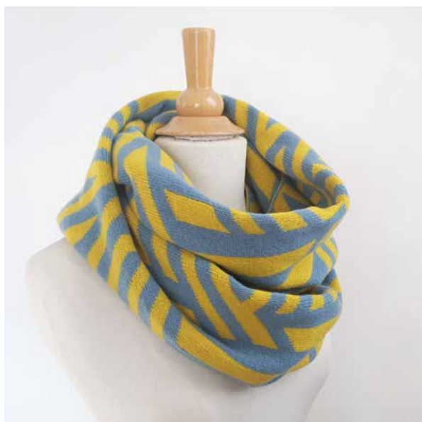
COLWAY 2 - PICCALILLI YELLOW AND PETREL GREY