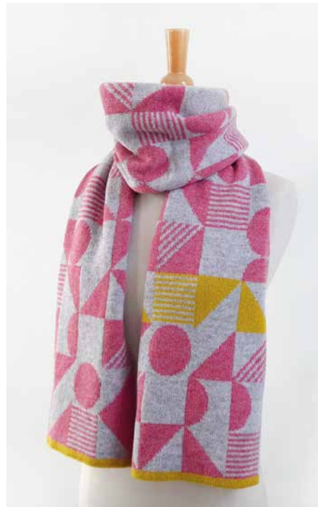
COLWAY 3 - NOUGAT PINK, PEARL GREY AND PICCALILLI YELLOW