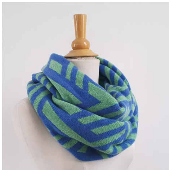
COLWAY 3 - SPRINGTIME GREEN AND TAHITI BLUE