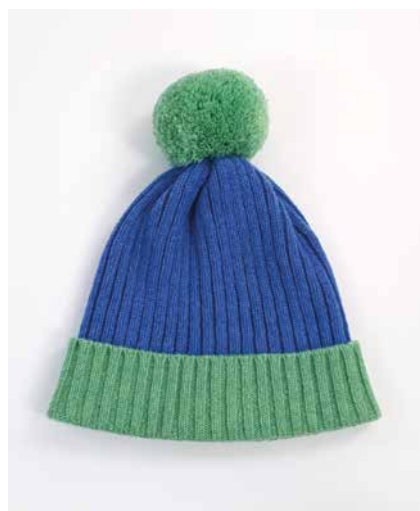
COLWAY 3 - SPRINGTIME GREEN AND TAHITI BLUE