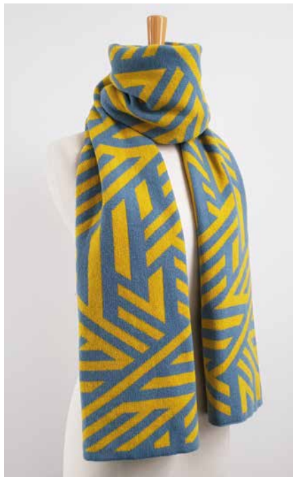
COLWAY 2 - PICCALILLI YELLOW AND PETREL GREY