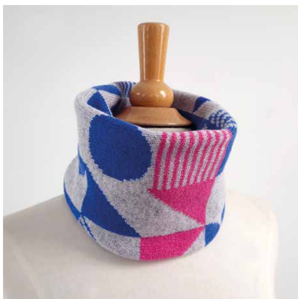
COLWAY 2 - TAHITI BLUE, PEARL GREY AND BUBBLEGUM