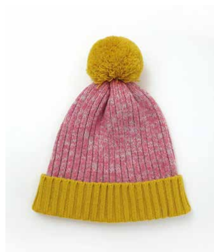
COLWAY 3 - NOUGAT PINK, PEARL GREY AND PICCALILLI YELLOW