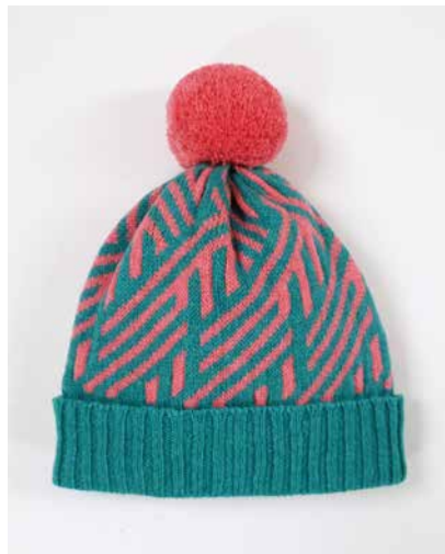
COLWAY 1 - LIPSTICK PINK AND SHAMROCK GREEN

100% LAMBSWOOL, JACQUARD KNITTED, POM POM HAT KNITTED IN 2PLY YARN MEASURES APPROX. 23 X 25CMS WITH POM