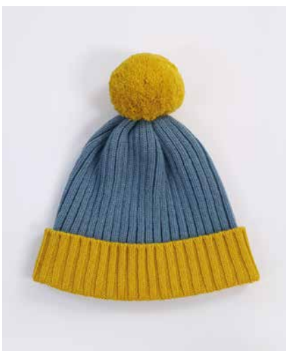
COLWAY 2 - PICCALILLI YELLOW AND PETREL GREY