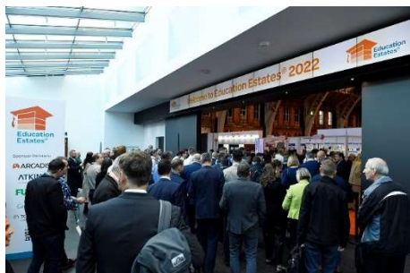
Attendees at registration

Photographs from last year's event (higher resolution available on request):