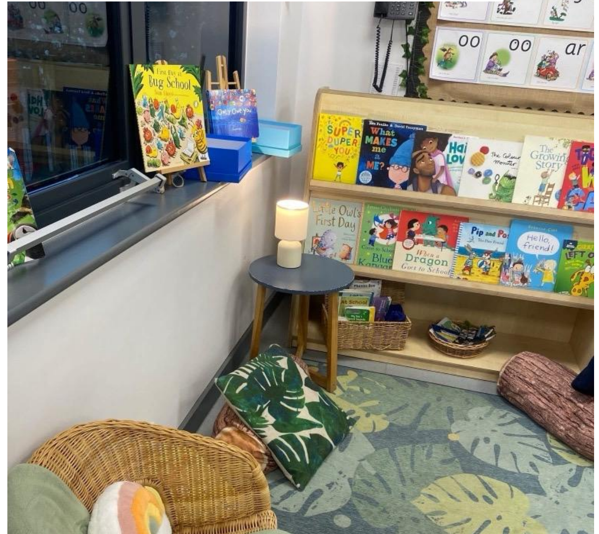
Bugle School & Nursery