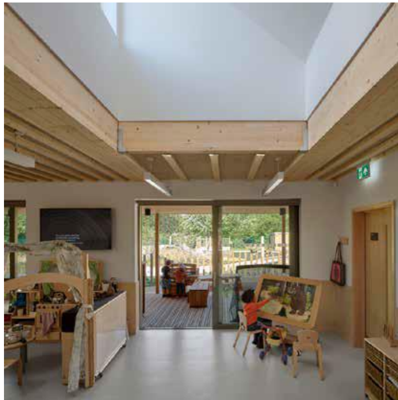
VIEWS TO THE FOREST