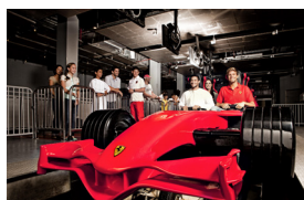
Shows and tickets